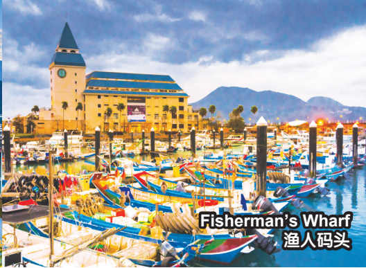
Fisherman's Wharf 渔人码头