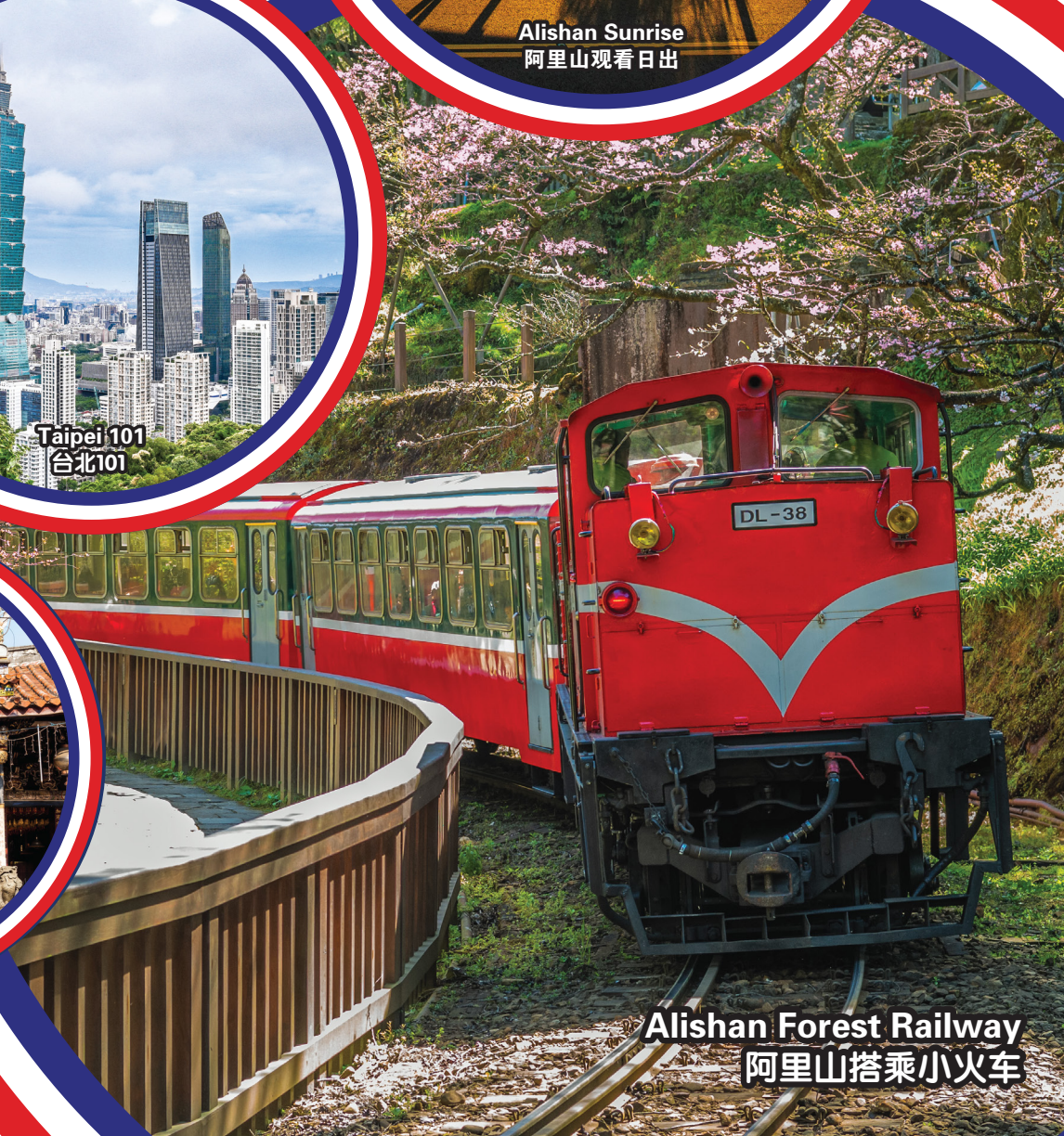
Alishan Forest Railway 阿里山搭乘小火车

行程次序，以当地旅社安排为准。 Sequences of Itinerary are subject to local arrangement.