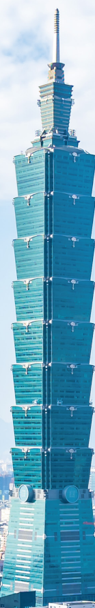
Taipei 101 Shopping Mall 台北101购物商场

行程次序，以当地旅社安排为准。 Sequences of Itinerary are subject to local arrangement.