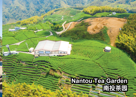
Nantou Tea Garden 南投茶园