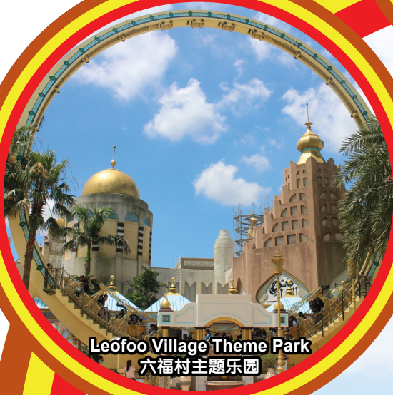
Leofoo Village Theme Park 六福村主题乐园