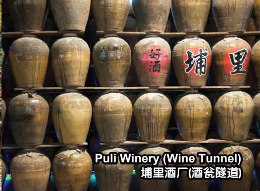
Puli Winery (Wine Tunnel) 埔里酒厂(酒瓮隧道)