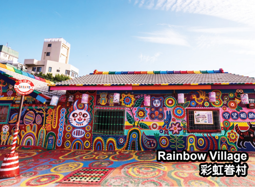
Rainbow Village 彩虹眷村