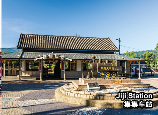
Jiji Station 集集车站