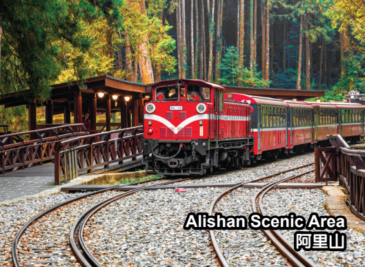
Alishan Scenic Area 阿里山