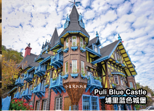
Puli Blue Castle 埔里蓝色城堡