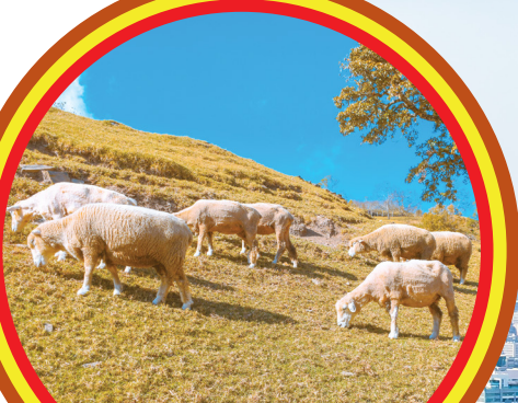
Qingjing Farm 清境青青草原