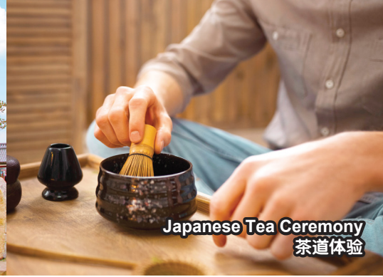
Japanese Tea Ceremony 茶道体验