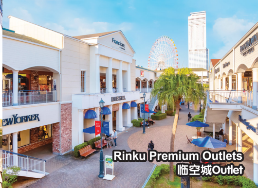
Rinku Premium Outlets 临空城Outlet