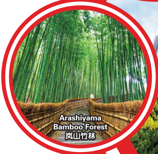
Arashiyama Bamboo Forest 岚山竹林