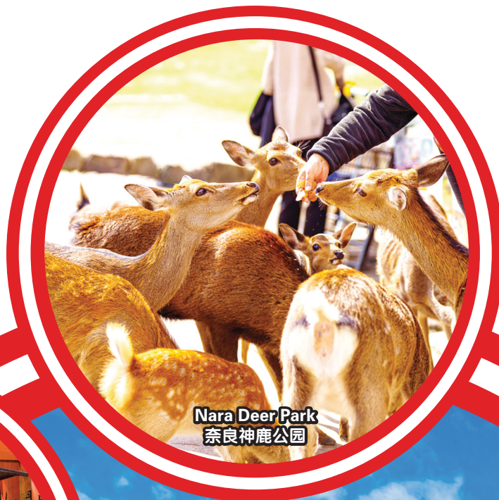
Nara Deer Park 奈良神鹿公园