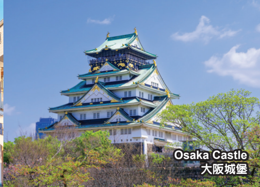
Osaka Castle 大阪城堡