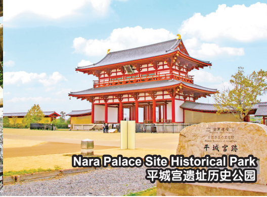
Nara Palace Site Historical Park 平城宮遗址历史公园