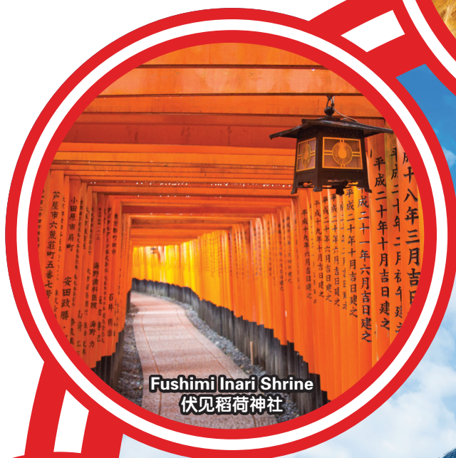
Fushimi Inari Shrine 伏见稻荷神社