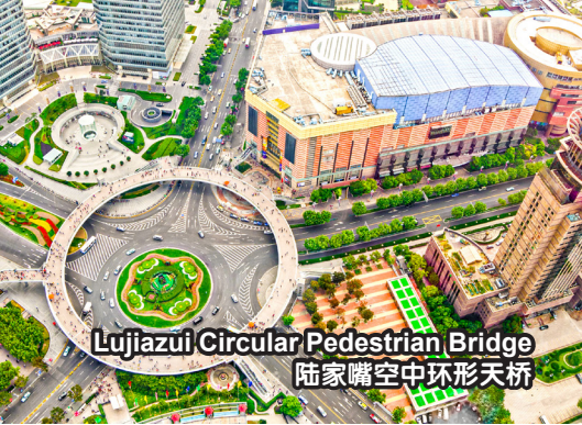
Lujiazui Circular Pedestrian Bridge 陆家嘴空中环形天桥