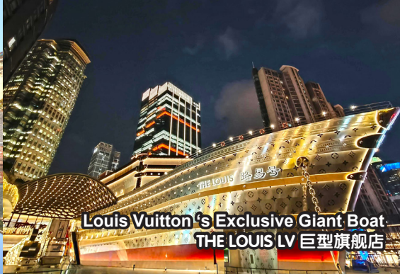
Louis Vuitton's Exclusive Giant Boat THE LOUIS LV 巨型旗舰店