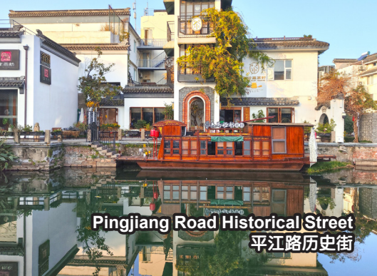
Pingjiang Road Historical Street 平江路历史街