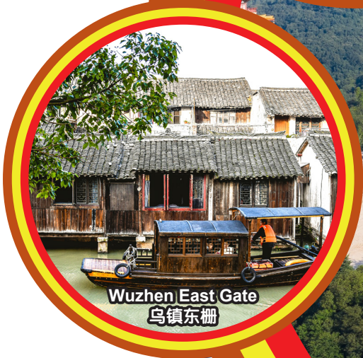
Wuzhen East Gate 乌镇东栅