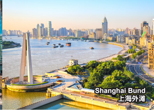
Shanghai Bund 上海外滩