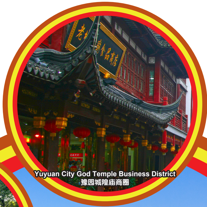
Yuyuan City God Temple Business District 豫园城隍庙商圈