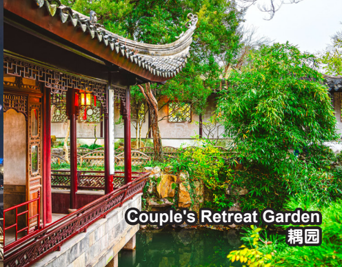
Couple's Retreat Garden 耦园