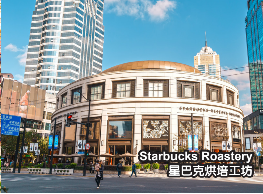
Starbucks Roastery 星巴克烘焙工坊