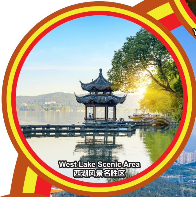
West Lake Scenic Area 西湖风景名胜区