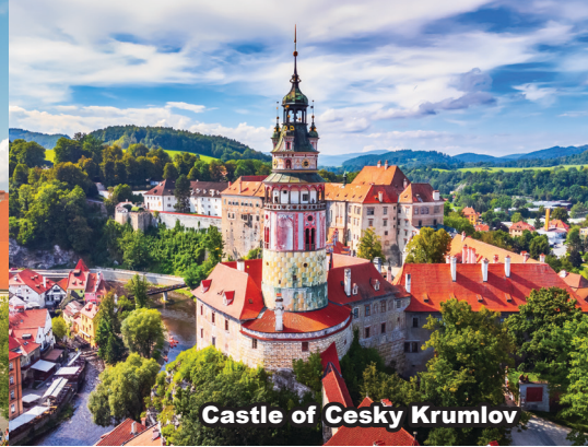
Castle of Cesky Krumlov