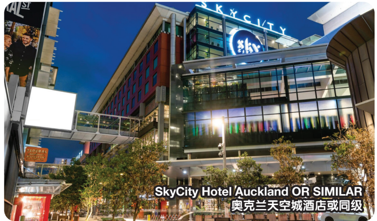
SkyCity Hotel Auckland OR SIMILAR 奥克兰天空城酒店或同级