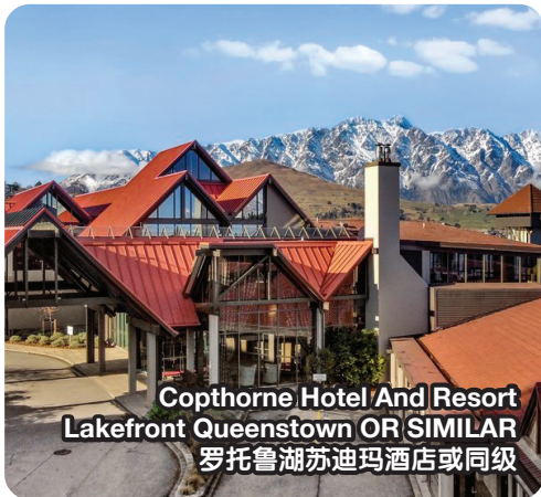
Copthorne Hotel And Resort Lakefront Queenstown OR SIMILAR 罗托鲁湖苏迪玛酒店或同级