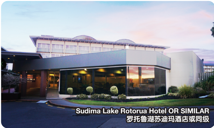
Sudima Lake Rotorua Hotel OR SIMILAR 罗托鲁湖苏迪玛酒店或同级