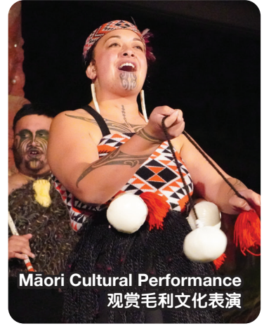
Māori Cultural Performance 观赏毛利文化表演