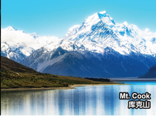
Mt. Cook 库克山