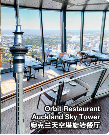
Orbit Restaurant Auckland Sky Tower 奥克兰天空塔旋转餐厅