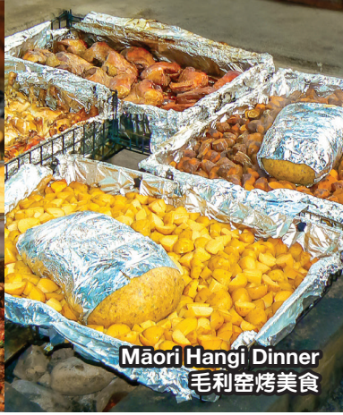
Māori Hangi Dinner 毛利窑烤美食