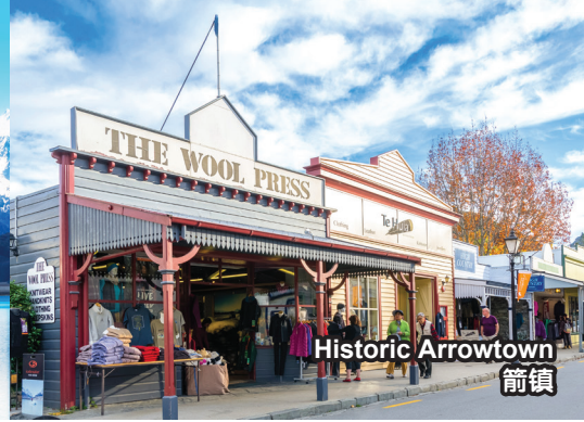
Historic Arrowtown 箭镇