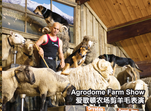
Agrodome Farm Show 爱歌顿农场剪羊毛表演