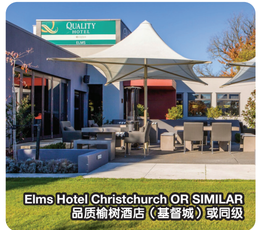
Elms Hotel Christchurch OR SIMILAR 品质榆树酒店 (基督城) 或同级