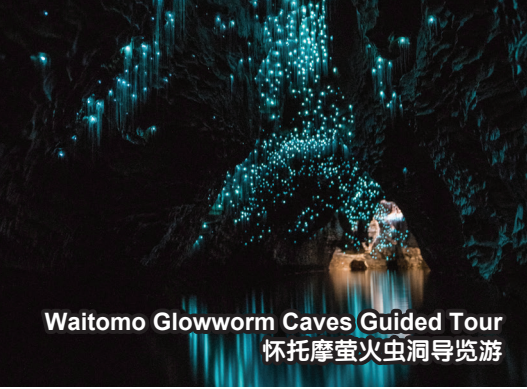
Waitomo Glowworm Caves Guided Tour 怀托摩萤火虫洞导览游