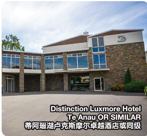
Distinction Luxmore Hotel Te Anau OR SIMILAR 蒂阿瑙湖卢克斯摩尔卓越酒店或同级