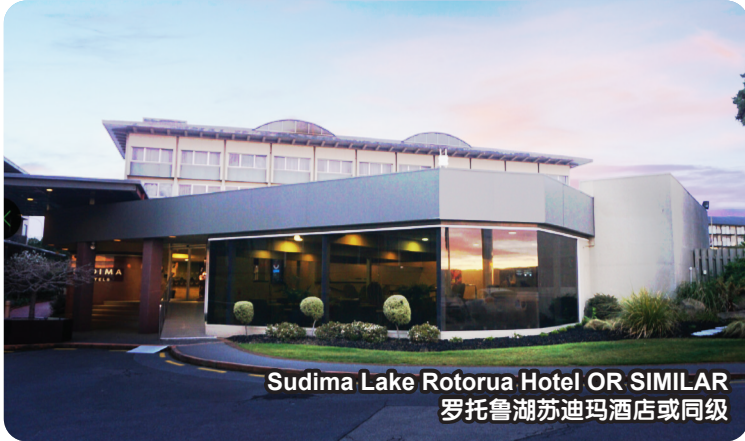
Sudima Lake Rotorua Hotel OR SIMILAR 罗托鲁湖苏迪玛酒店或同级