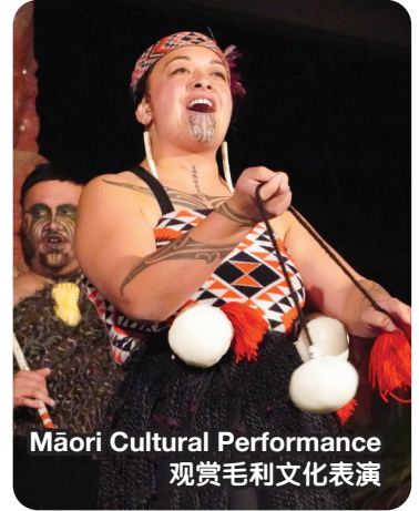
Māori Cultural Performance 观赏毛利文化表演