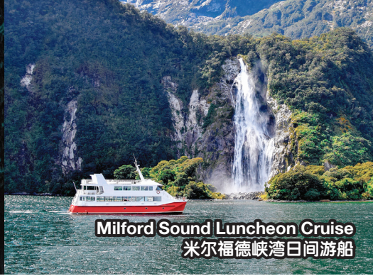
Milford Sound Luncheon Cruise 米尔福德峡湾日间游船