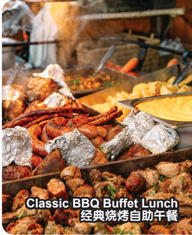
Classic BBQ Buffet Lunch 经典烧烤自助午餐