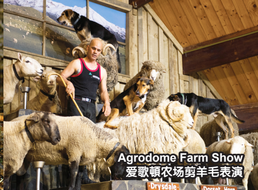
Agrodome Farm Show 爱歌顿农场剪羊毛表演