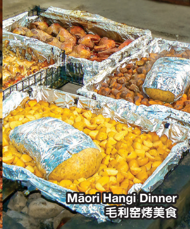
Māori Hangi Dinner 毛利窑烤美食