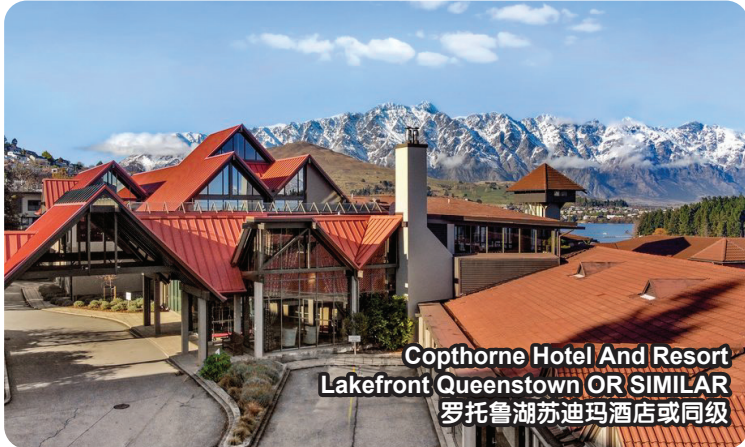
Copthorne Hotel And Resort Lakefront Queenstown OR SIMILAR 罗托鲁湖苏迪玛酒店或同级