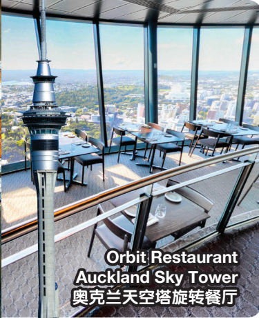
Orbit Restaurant Auckland Sky Tower 奥克兰天空塔旋转餐厅