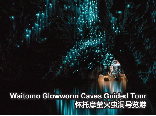
Waitomo Glowworm Caves Guided Tour 怀托摩萤火虫洞导览游