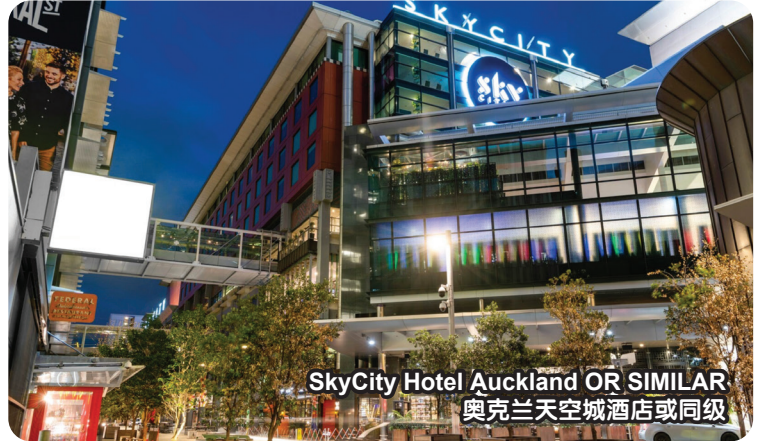
SkyCity Hotel Auckland OR SIMILAR 奥克兰天空城酒店或同级