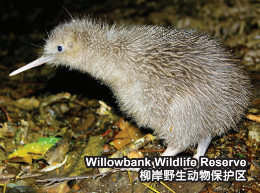
Willowbank Wildlife Reserve 柳岸野生动物保护区