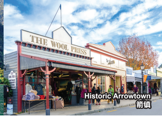
Historic Arrowtown 箭镇