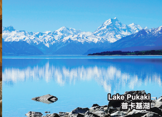
Lake Pukaki 普卡基湖