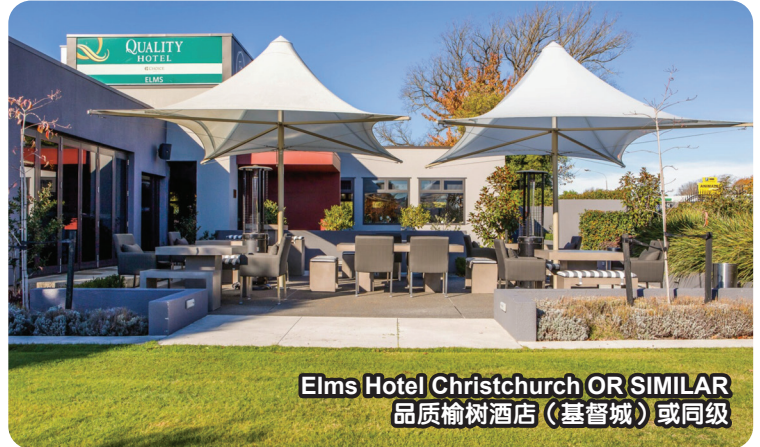
Elms Hotel Christchurch OR SIMILAR 品质榆树酒店 (基督城) 或同级