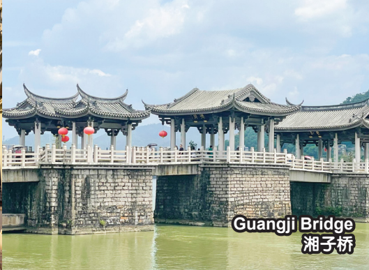
Guangji Bridge 湘子桥