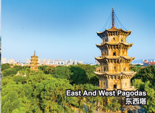
East And West Pagodas 东西塔