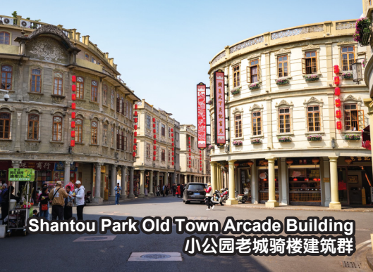
Shantou Park Old Town Arcade Building 小公园老城骑楼建筑群