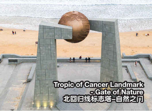
Tropic of Cancer Landmark - Gate of Nature 北回归线标志塔-自然之门