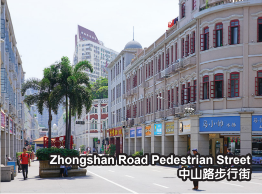
Zhongshan Road Pedestrian Street 中山路步行街