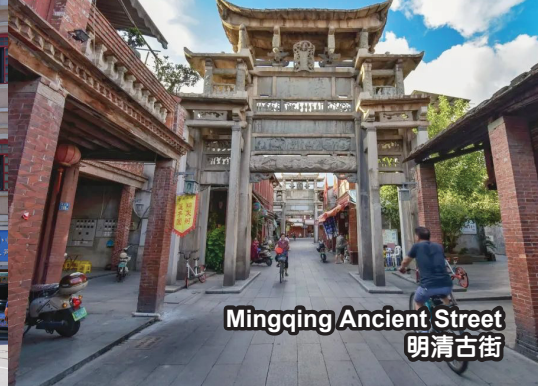
Mingqing Ancient Street 明清古街