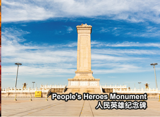
People's Heroes Monument 人民英雄纪念碑