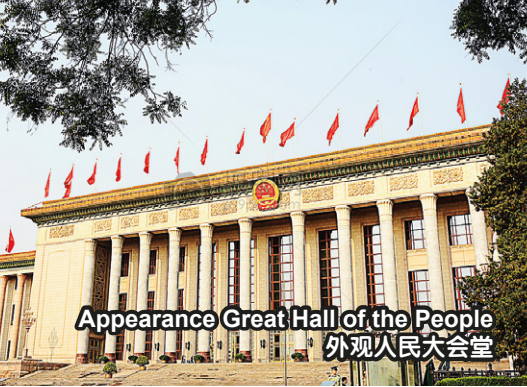
Appearance Great Hall of the People 外观人民大会堂