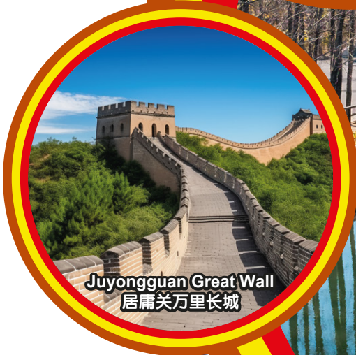
Juyongguan Great Wall 居庸关万里长城