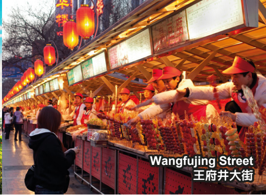
Wangfujing Street 王府井大街