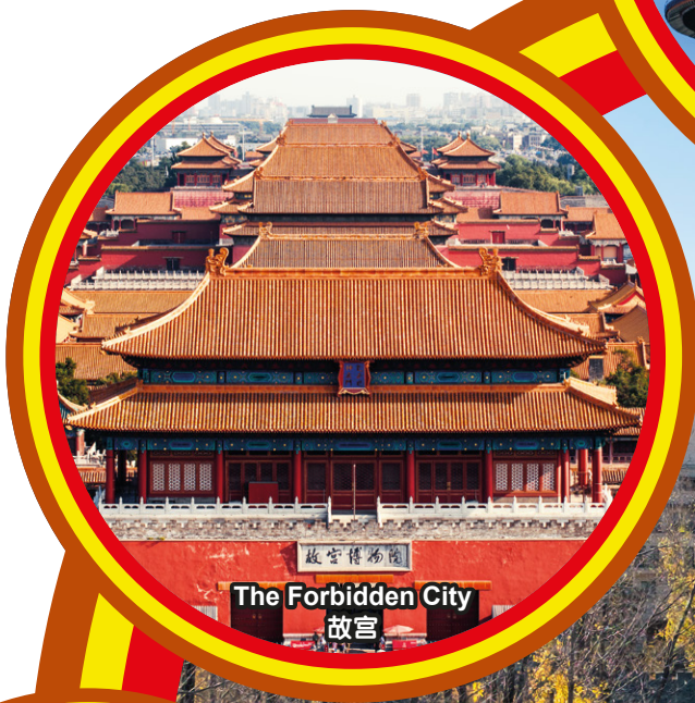
The Forbidden City 故宫