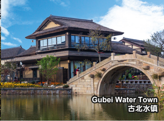
Gubei Water Town 古北水镇