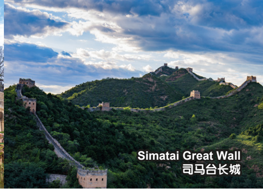
Simatai Great Wall 司马台长城