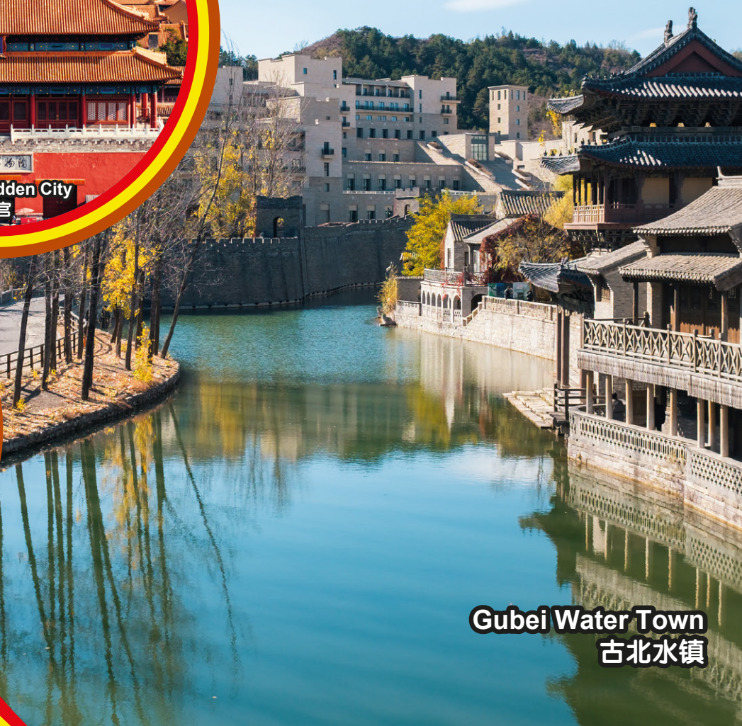
Gubei Water Town 古北水镇