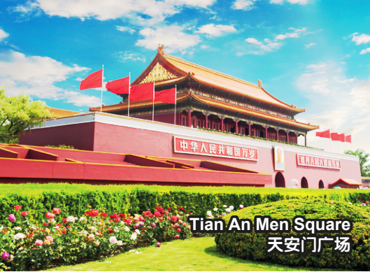
Tian An Men Square 天安门广场