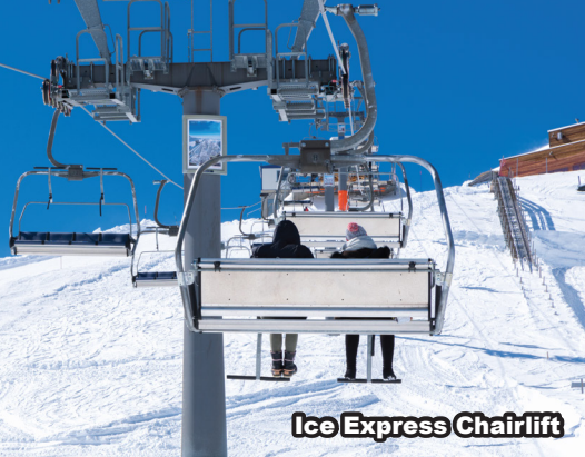
Ice Express Chairlift