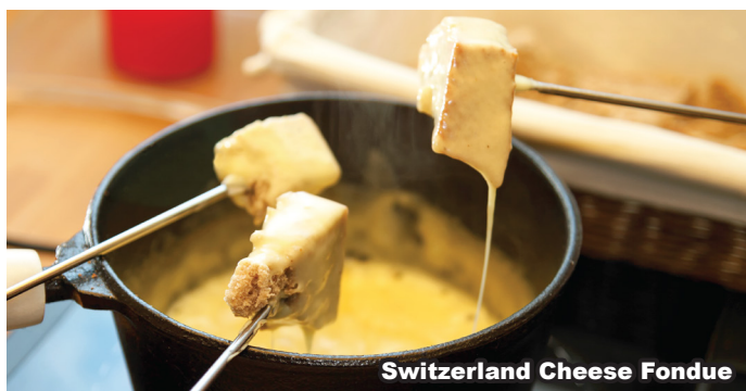
Switzerland Cheese Fondue

Disclaimer: During major conferences, fairs and festivals, act of nature and heavy flow of tourist arrival, the sequence of itinerary may change and accommodation may be located in an alternative city without prior notice.