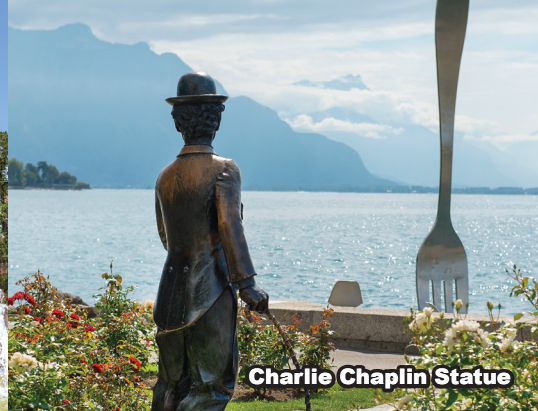
Charlie Chaplin Statue