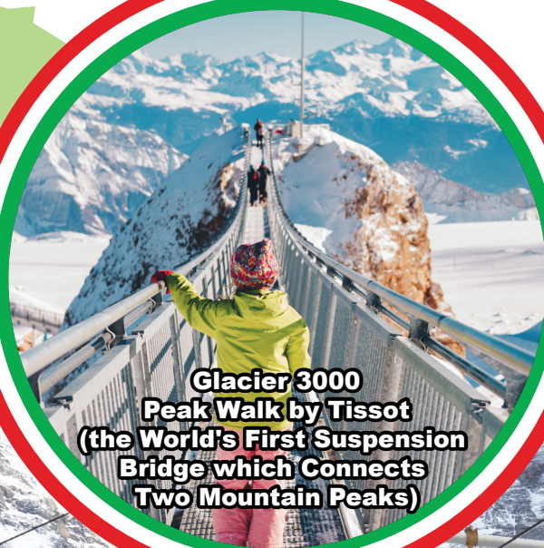
Glacier 3000 Peak Walk by Tissot (the World's First Suspension Bridge which Connects Two Mountain Peaks)