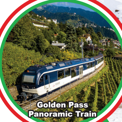
Golden Pass Panoramic Train