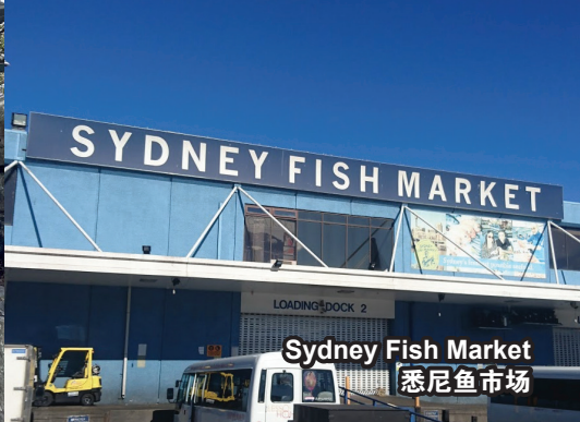
Sydney Fish Market 悉尼鱼市场