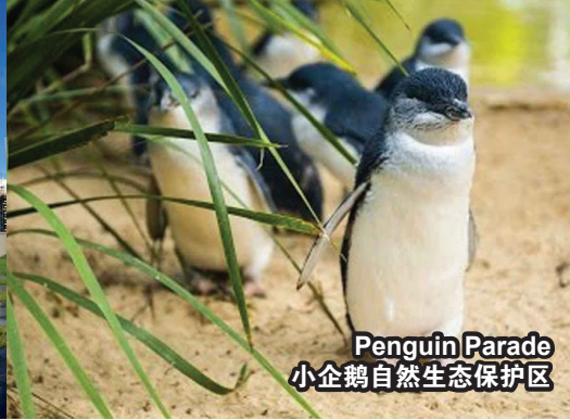
Penguin Parade 小企鹅自然生态保护区