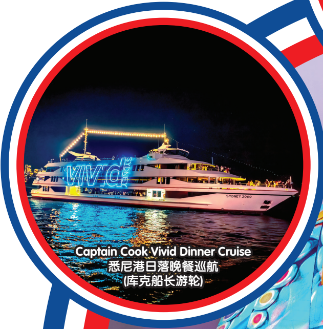
Captain Cook Vivid Dinner Cruise 悉尼港日落晚餐巡航 (库克船长游轮)