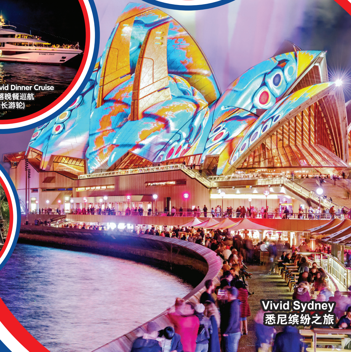
Vivid Sydney 悉尼缤纷之旅

行程 序, 以 地!!!! 准。 Sequences of Itinerary! are! subject to! local! arrangement.