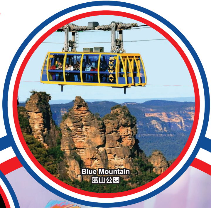
Blue Mountain 蓝山公园

特别安排 SPECIAL ARRANGEMENTS 悉尼缤纷之旅 VIVID SYDNEY