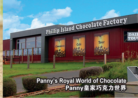
Panny's Royal World of Chocolate Panny皇家巧克力世界