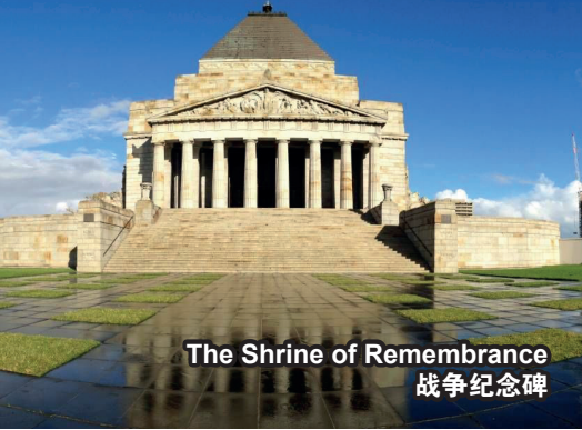
The Shrine of Remembrance 战争纪念碑