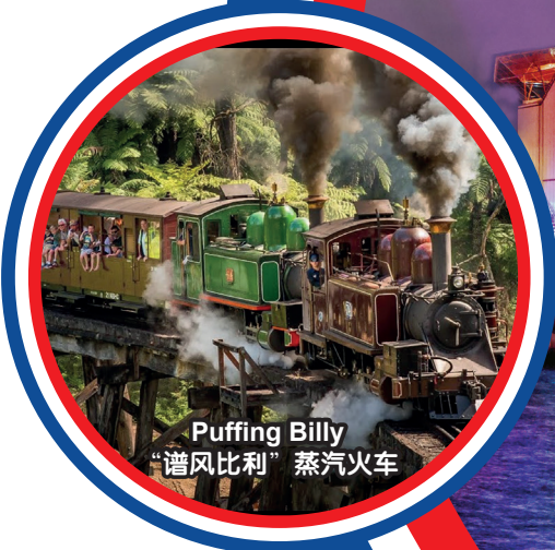
Puffing Billy “谱风比利” 蒸汽火车