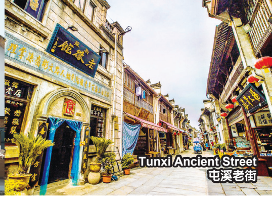
Tunxi Ancient Street 屯溪老街