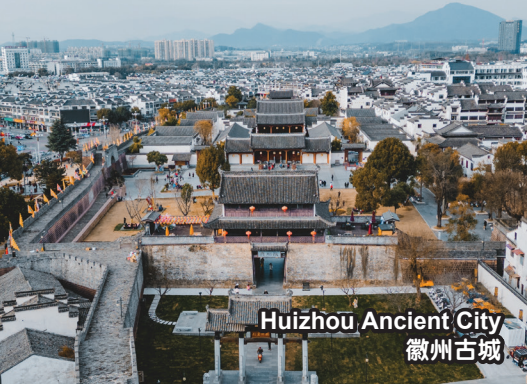
Huizhou Ancient City 徽州古城