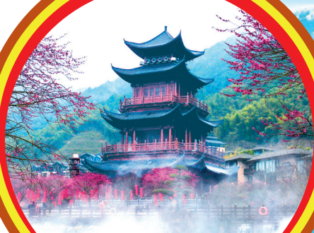
Gexian Village Resort 葛仙村