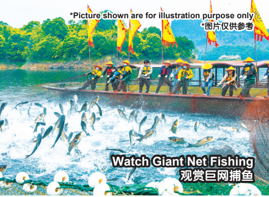
Watch Giant Net Fishing 观赏巨网捕鱼

*Picture shown are for illustration purpose only *图片仅供参考