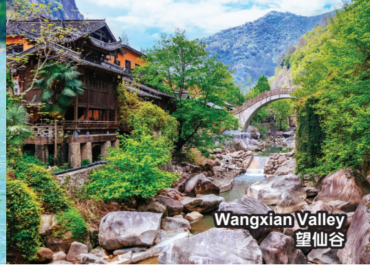
Wangxian Valley 望仙谷