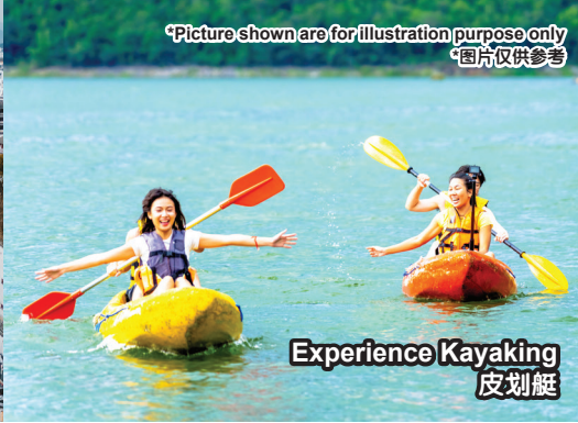
Experience Kayaking 皮划艇