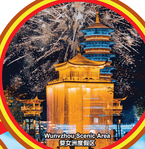
Wunzhou Scenic Area 婺女洲度假区