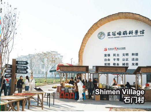
Shimen Village 石门村