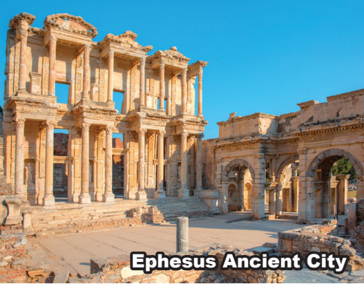
Ephesus Ancient City