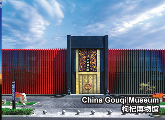
China Gouqi Museum 枸杞博物馆