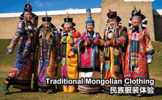
Traditional Mongolian Clothing 民族服装体验

*Picture shown are for illustration purpose only *图片仅供参考