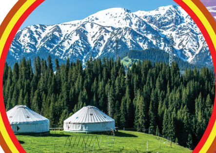
Ordos Grassland 鄂尔多斯草原

行程次序, 以当地旅社安排为准。 Sequences of Itinerary are subject to local arrangement.