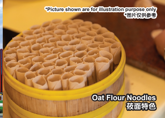
Oat Flour Noodles 莜面特色

*Picture shown are for illustration purpose only *图片仅供参考