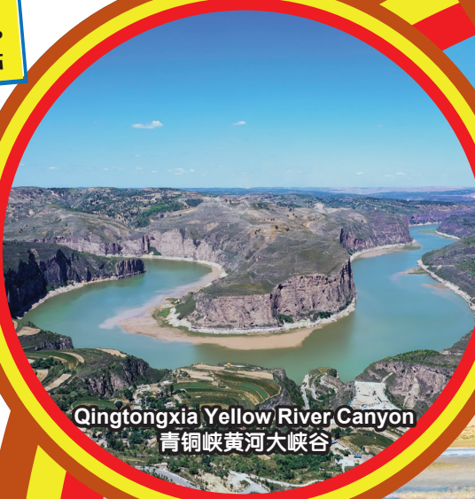
Qingtongxia Yellow River Canyon 青铜峡黄河大峡谷