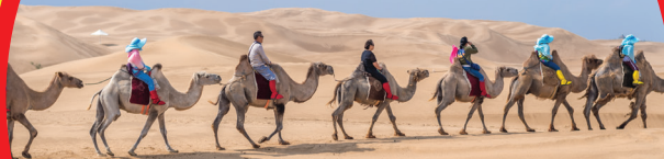
Camel Riding 沙漠骑骆驼