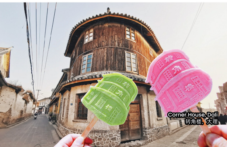
Corner House, Dali 转角楼, 大理

行程次序以当地旅行社安排为准。行程，膳食，住宿，交通等可能会因不可抗力因素而更动，恕不另行通知。