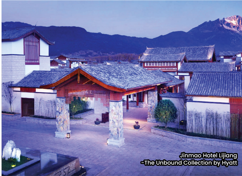
Jinmao Hotel Lijiang -The Unbound Collection by Hyatt

Embark on a complete journey at 4 to 5 star hotel, offering a quality & comfortable stay. 全程安排四至五星级酒店，让您在整个旅程中享受到有质量且舒适的住宿环境。