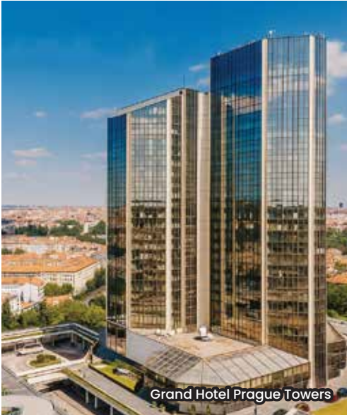
Grand Hotel Prague Towers