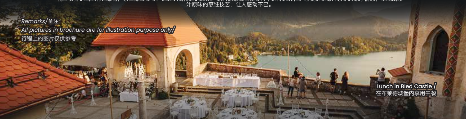
Lunch in Bled Castle / 在布莱德城堡内享用午餐