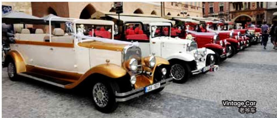
Vintage Car 老爷车