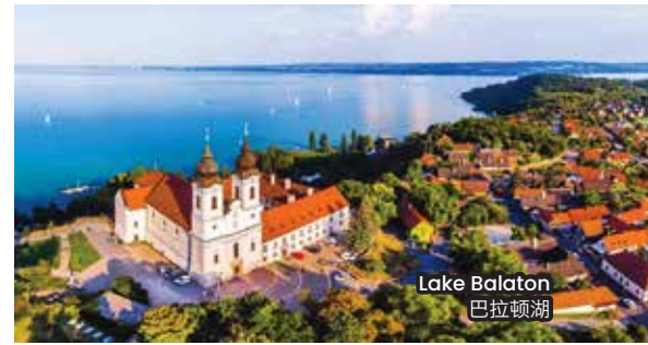
Lake Balaton 巴拉顿湖