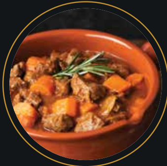
Hungarian Goulash 匈牙利炖牛肉