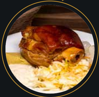
Roasted Pork Knuckle 烤猪手