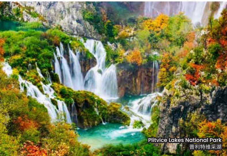
Plitvice Lakes National Park 普利特维采湖