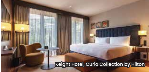
Keight Hotel, Curio Collection by Hilton