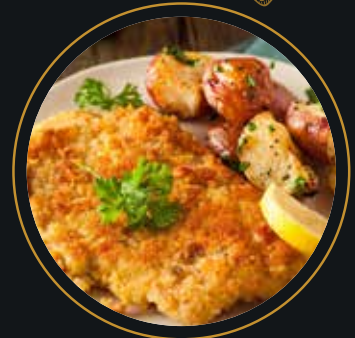
Wiener Schnitzel 维也纳炸肉排