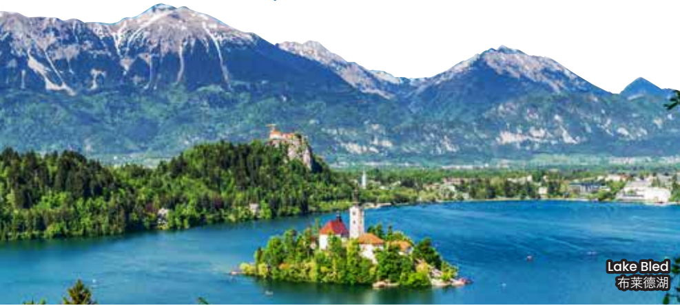
Lake Bled 布莱德湖