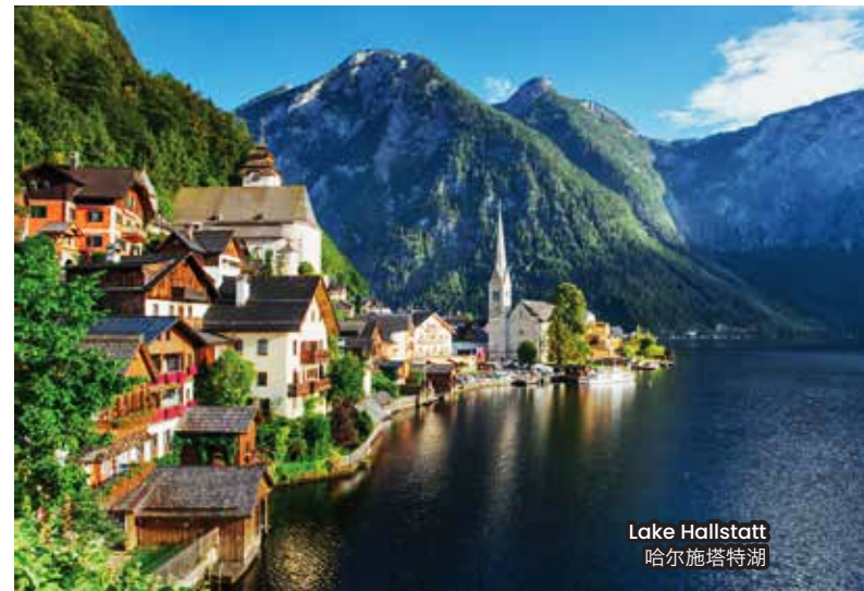
Lake Hallstatt 哈尔施塔特湖