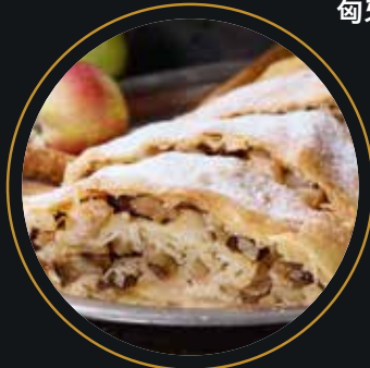
Apple Strudel 苹果卷