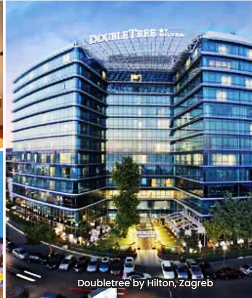
Doubletree by Hilton, Zagreb