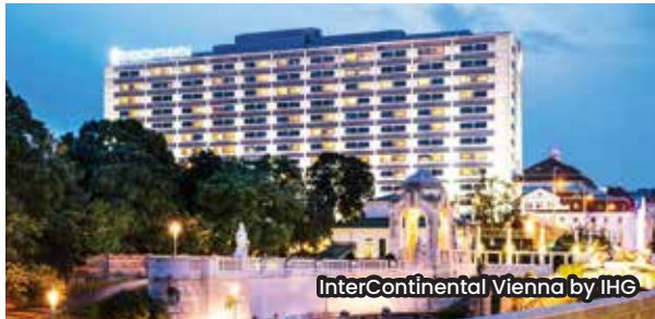
InterContinental Vienna by IHG