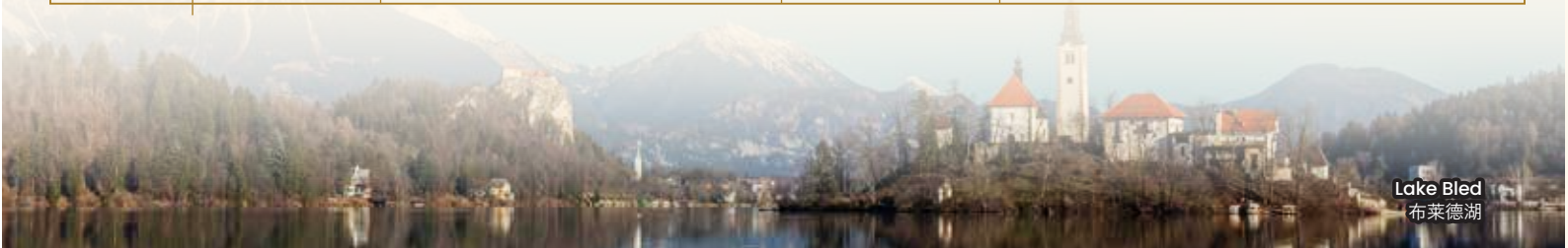
Lake Bled 布莱德湖