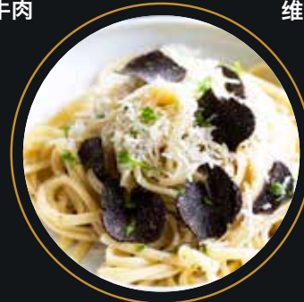
Classic Truffle Pasta 经典松露意面