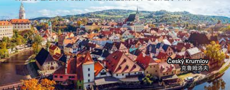
Český Krumlov 克鲁姆洛夫

这个城镇位于瓦尔塔瓦河畔，围绕一座13世纪城堡而建。这座城堡融合了哥特式、文艺复兴式以及巴洛克式风格。这是中世纪中欧小城的杰出典范，经历五个多世纪的和平发展，其建筑古迹被原封不动地保留了下来。