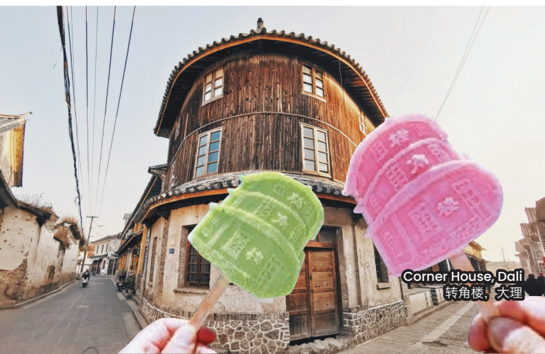
Corner House, Dali 转角楼, 大理

行程次序以当地旅行社安排为准。行程，膳食，住宿，交通等可能会因不可抗力因素而更动，恕不另行通知。