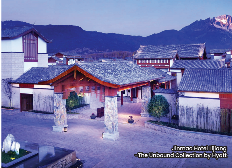
Jinmao Hotel Lijiang -The Unbound Collection by Hyatt