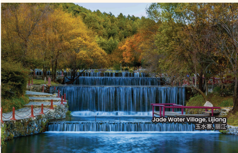
Jade Water Village, Lijiang 玉水寨, 丽江