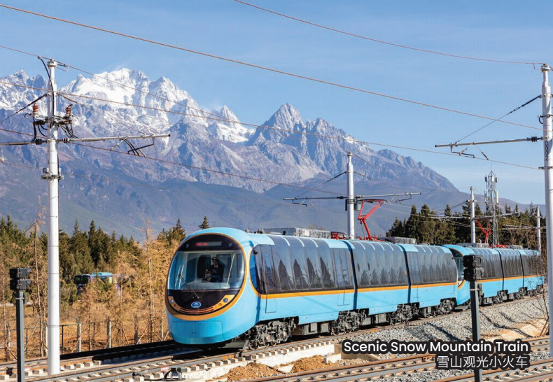
Scenic Snow Mountain Train 雪山观光小火车