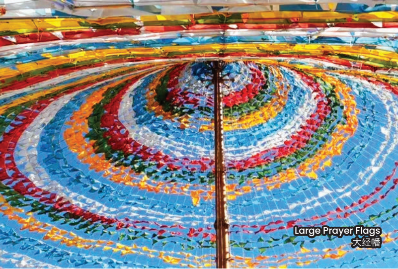
Large Prayer Flags 大经幡