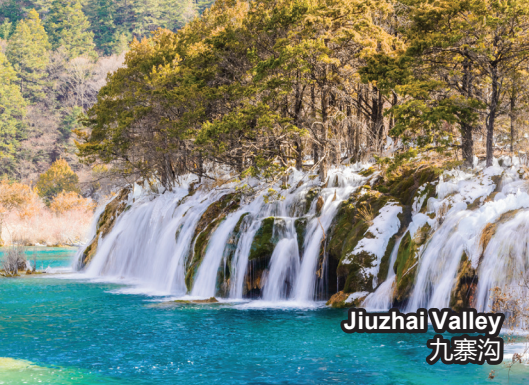
Jiuzhai Valley 九寨沟