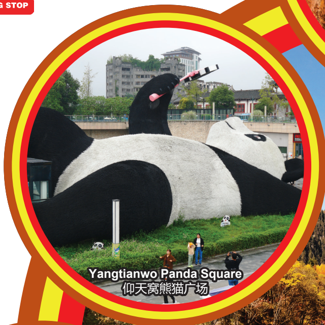
Yangtze River Giant Panda Square 仰天窝熊猫广场