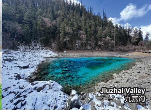
Jiuzhai Valley 九寨沟