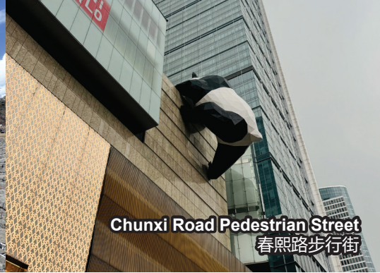
Chunxi Road Pedestrian Street 春熙路步行街