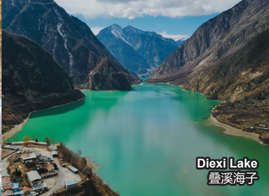
Diexi Lake 叠溪海子