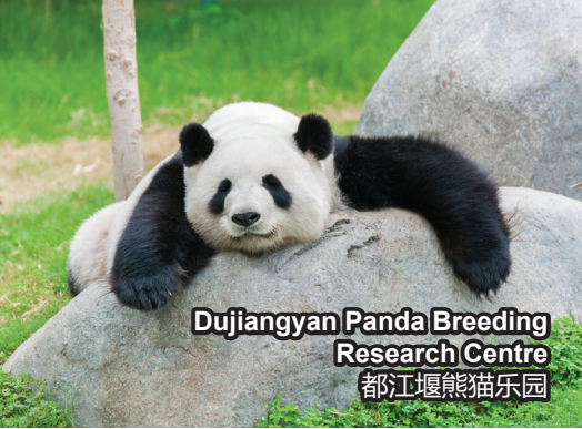
Dujiangyan Panda Breeding Research Centre 都江堰熊猫乐园