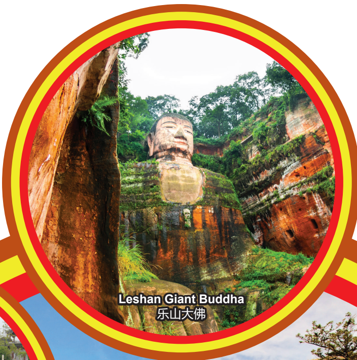
Leshan Giant Buddha 乐山大佛