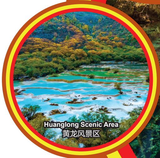
Huanglong Scenic Area 黄龙风景区