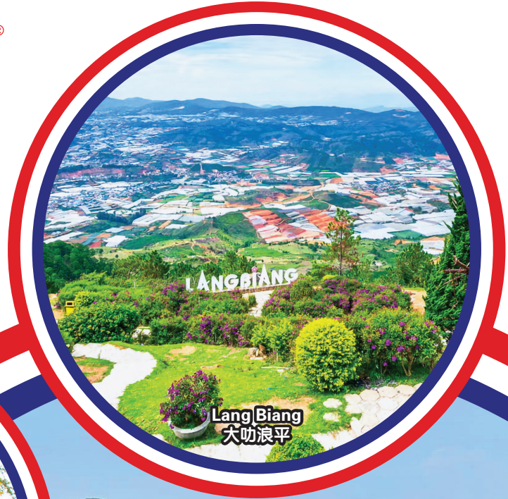
Lang Biang 大叻浪平