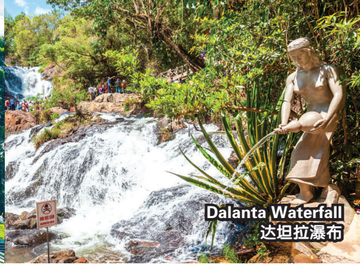
Dalanta Waterfall 达坦拉瀑布