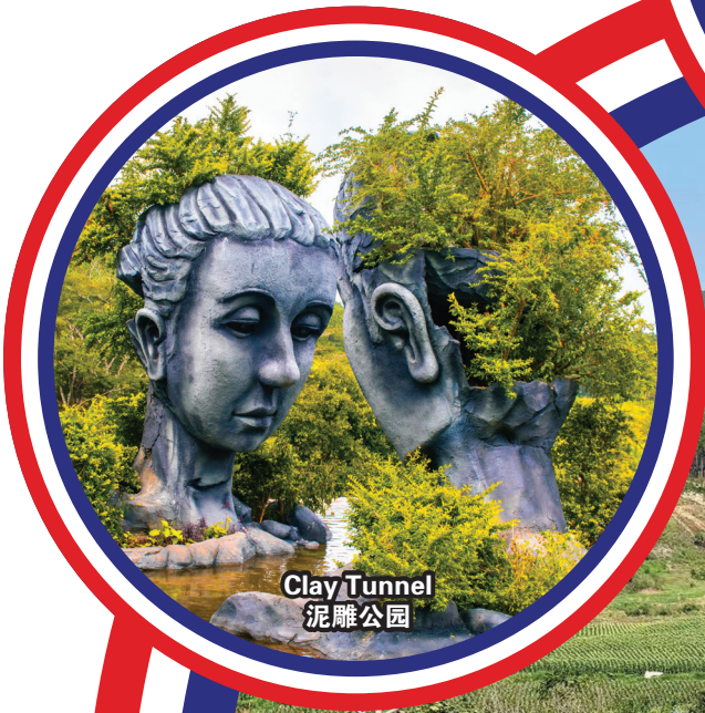
Clay Tunnel 泥雕公园