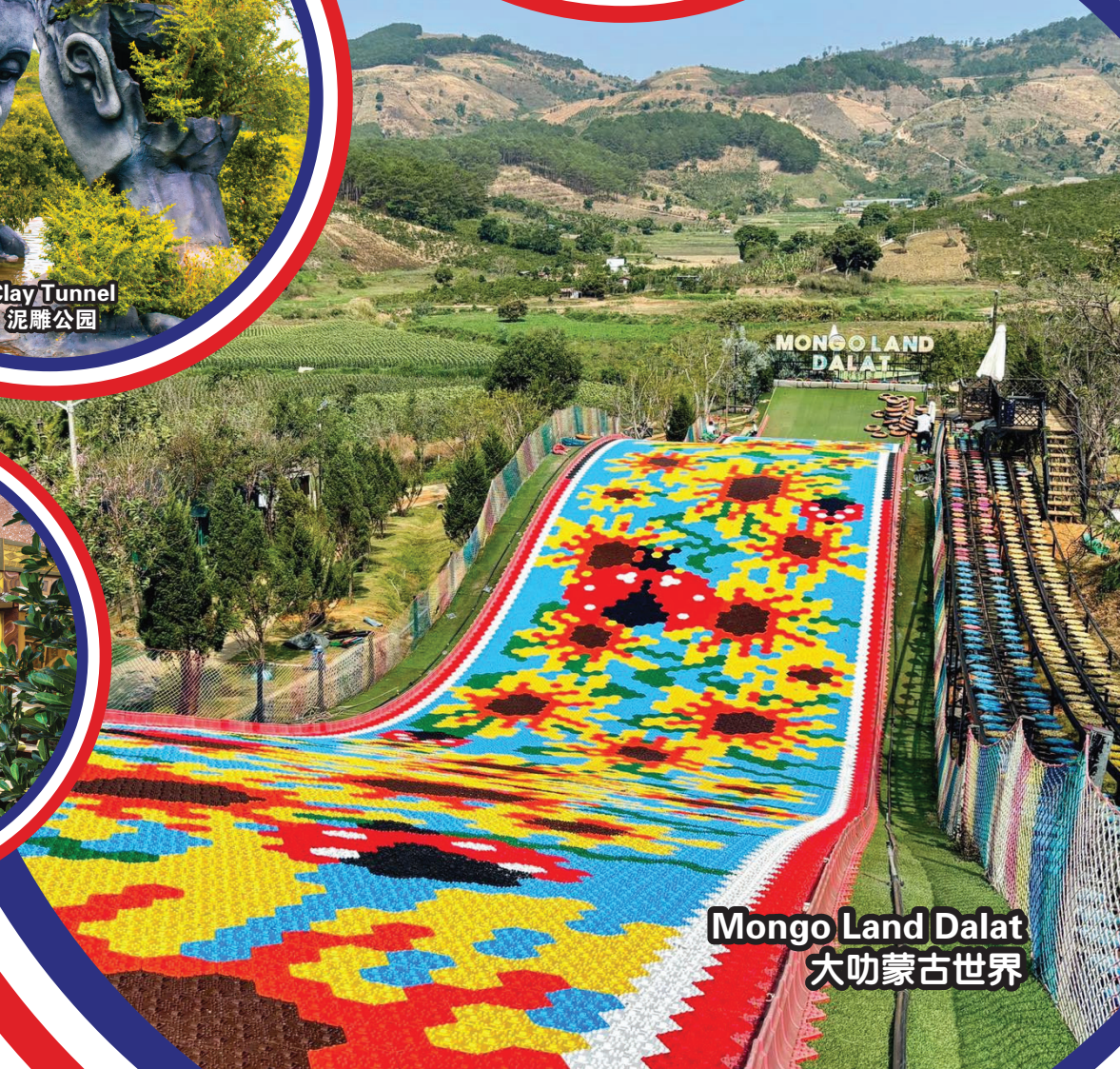
Mongol Land Dalat 大叻蒙古世界