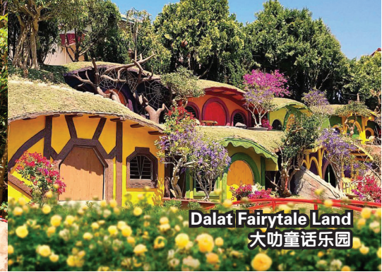
Dalat Fairytale Land 大叻童话乐园