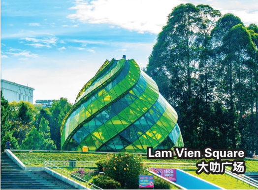
Lam Vien Square 大叻广场