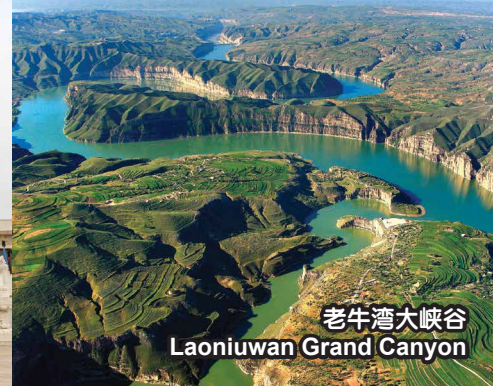
老牛湾大峡谷 Laoniawan Grand Canyon