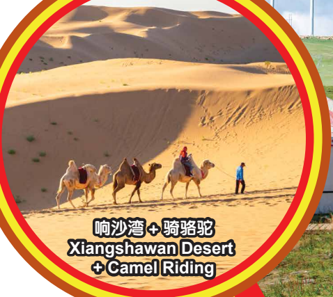
响沙湾+骑骆驼 Xiangshawan Desert + Camel Riding