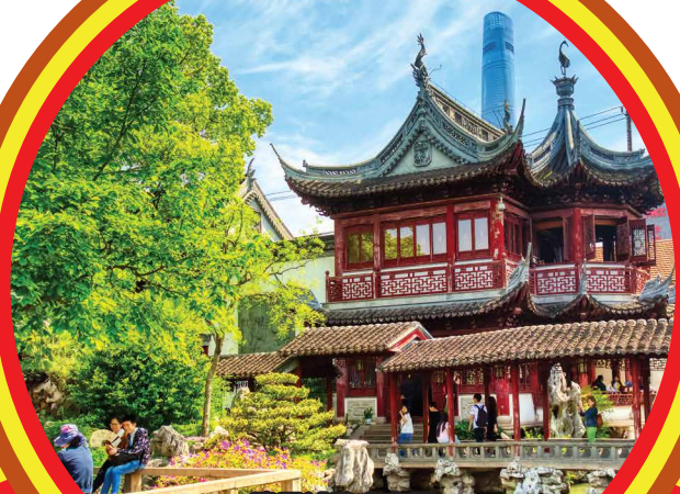
豫园城隍庙商圈 Yuyuan Garden & City God Temple Shopping Area