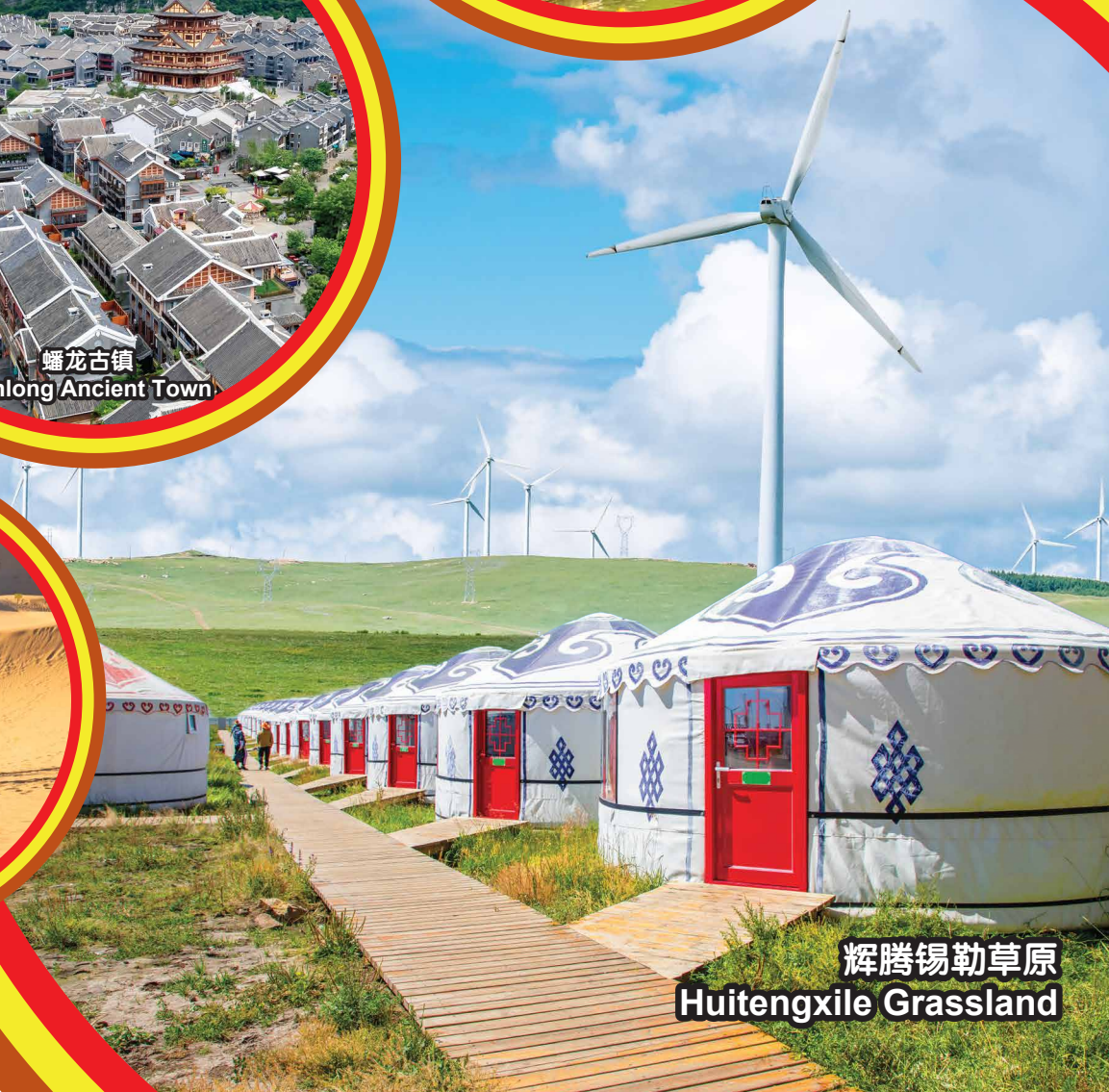
辉腾锡勒草原 Huitengxile Grassland

行程次序, 以当地旅社安排为准。 Sequences of Itinerary are subject to local arrangement.