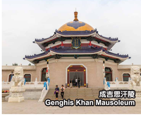
成吉思汗陵 Genghis Khan Mausoleum