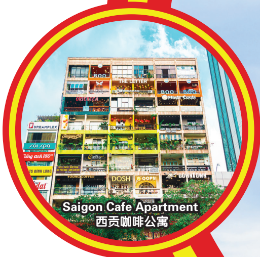
Saigon Cafe Apartment 西贡咖啡公寓