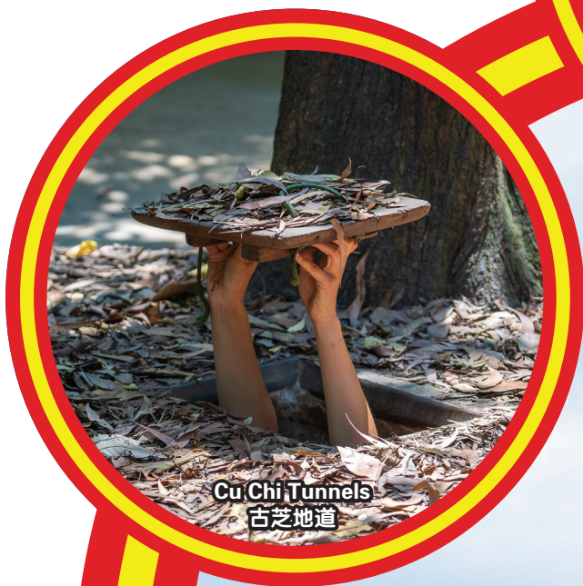
Cu Chi Tunnels 古芝地道