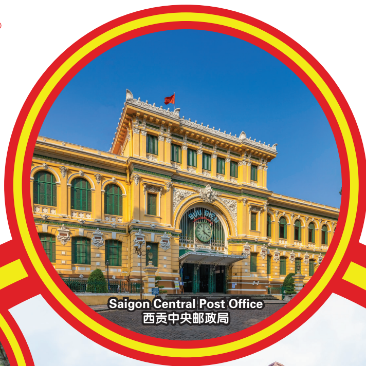
Saigon Central Post Office 西贡中央邮政局