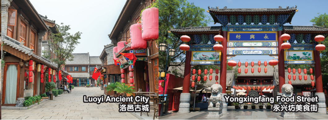
Luoyi Ancient City 洛邑古城