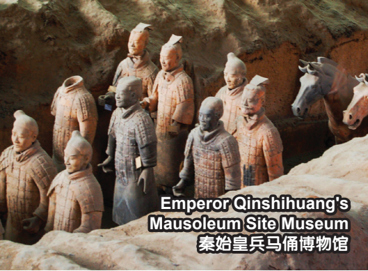
Emperor Qinshihuang's Mausoleum Site Museum 秦始皇兵马俑博物馆