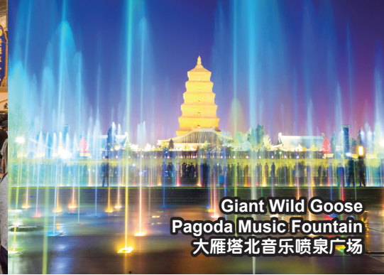
Giant Wild Goose Pagoda Music Fountain 大雁塔北音乐喷泉广场