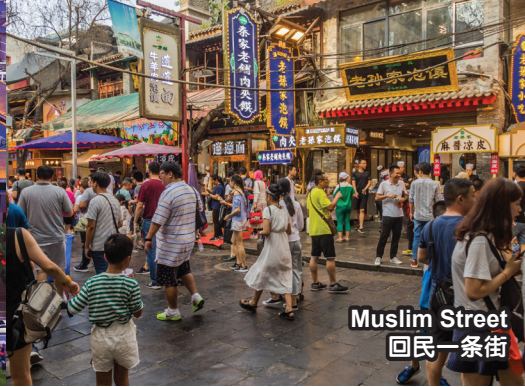
Muslim Street 回民一条街