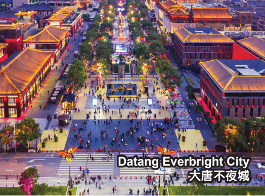
Datang Everbright City 大唐不夜城