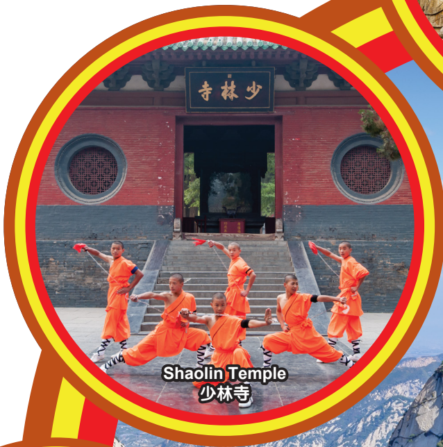
Shaolin Temple 少林寺