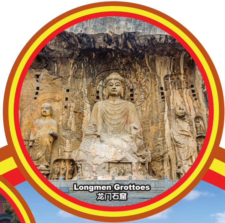
Longmen Grottoes 龙门石窟