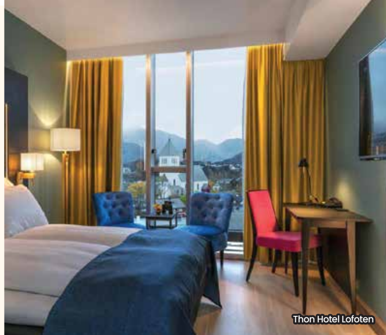
Thon Hotel Lofoten

*Triple Room Sharing Will Be Base on Extra Roll in Bed Basis. / *任何三人房或加床统一采用折叠式或床垫为标准。