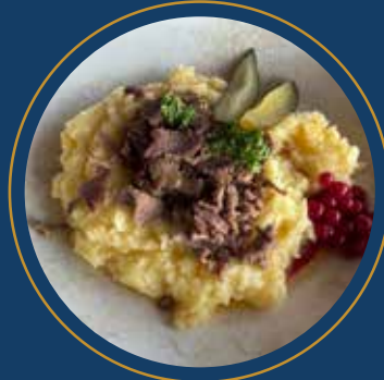
Reindeer Meat 驯鹿肉