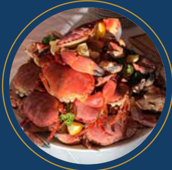
Brown Crab 面包蟹