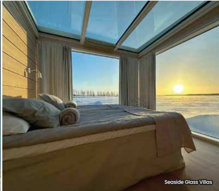
Seaside Glass Villas