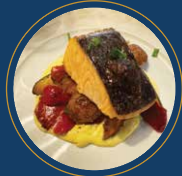
Norwegian Salmon 挪威三文鱼