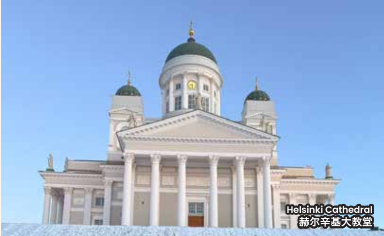
Helsinki Cathedral 赫辛基大教堂