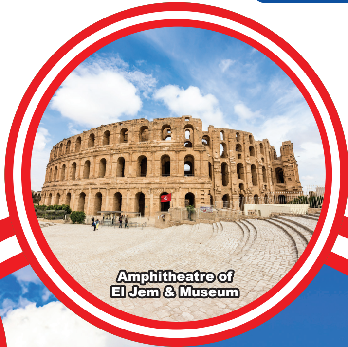
Amphitheatre of El Jem & Museum