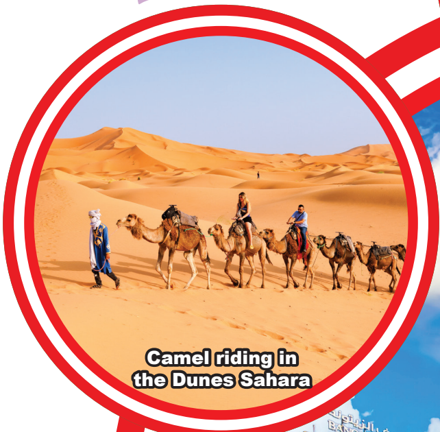
Camel riding in the Dunes Sahara