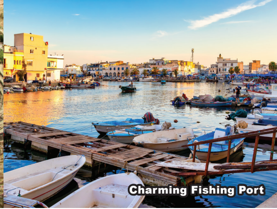
Charming Fishing Port