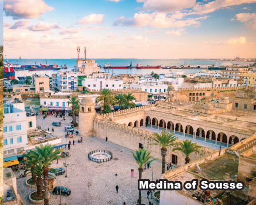
Medina of Sousse