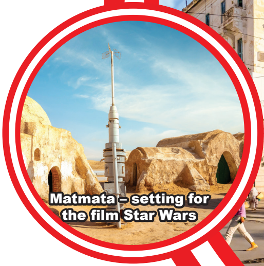
Matmata – setting for the film Star Wars