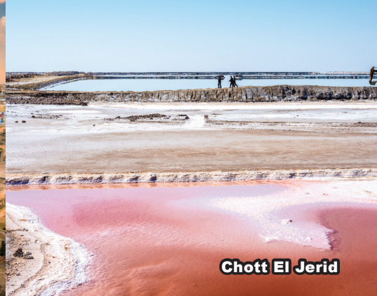
Chott El Jerid