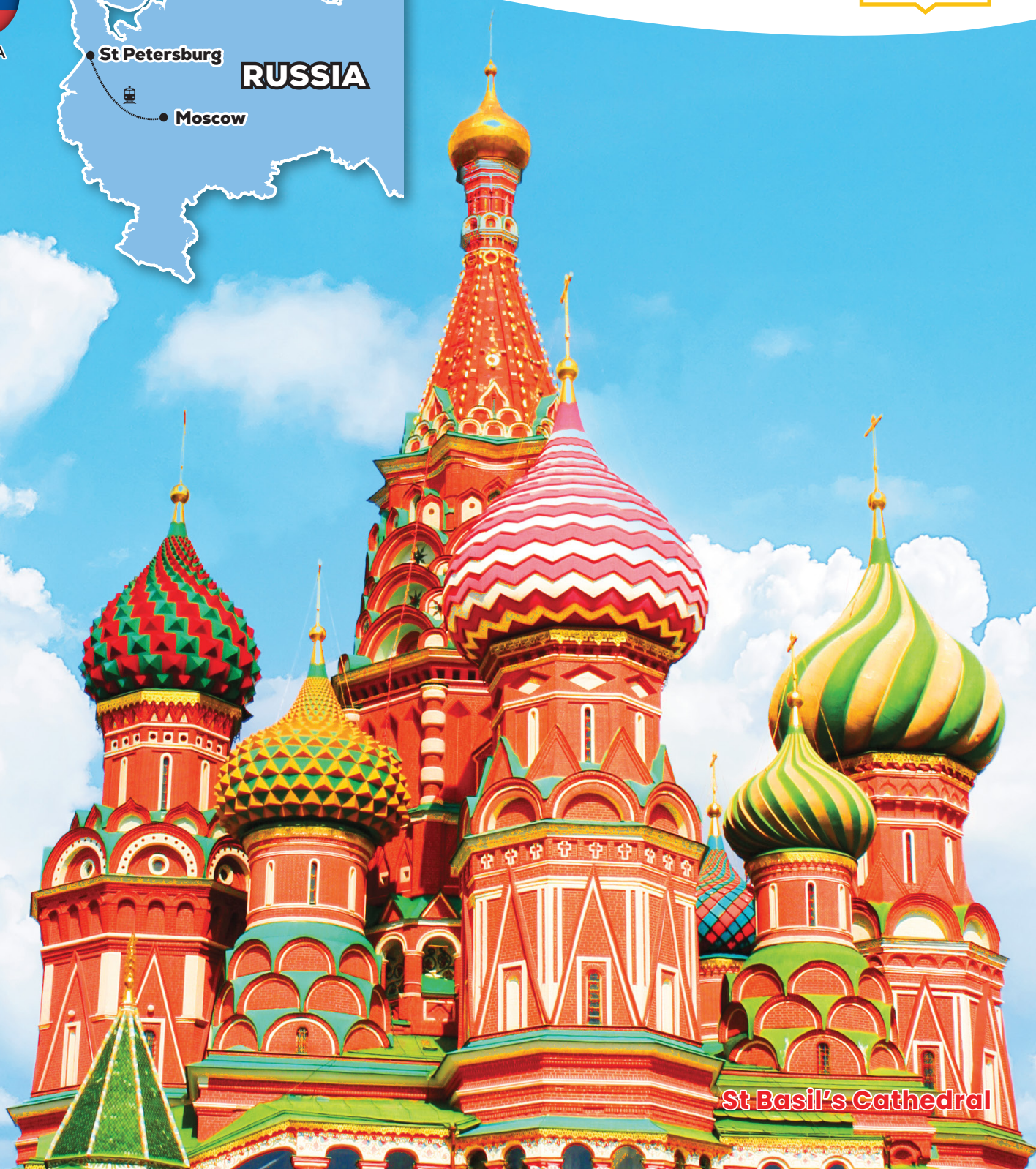
St Basil's Cathedral