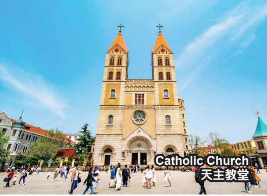
Catholic Church 天主教堂