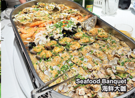
Seafood Banquet 海鲜大咖