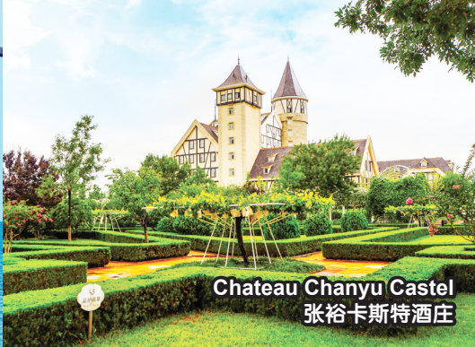
Chateau Chanyu Castel 张裕卡斯特酒庄