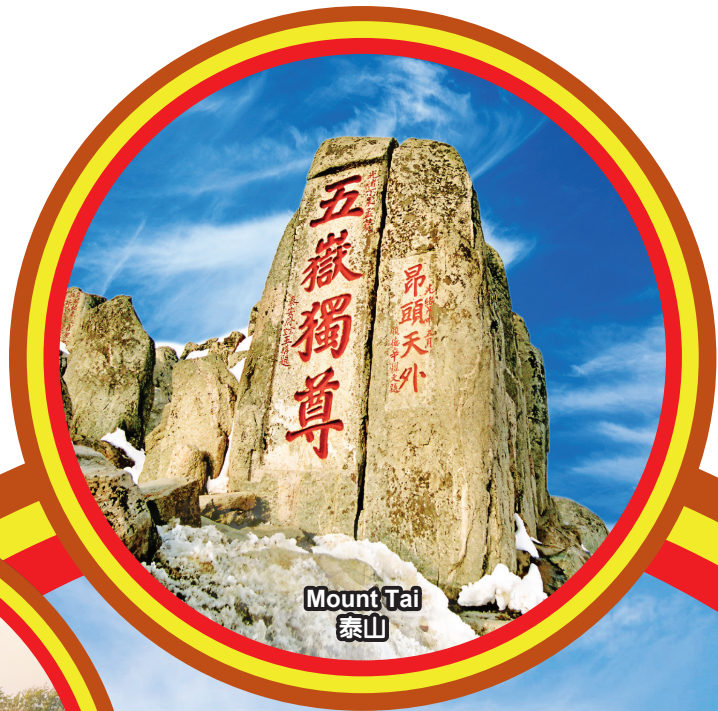
Mount Tai 泰山