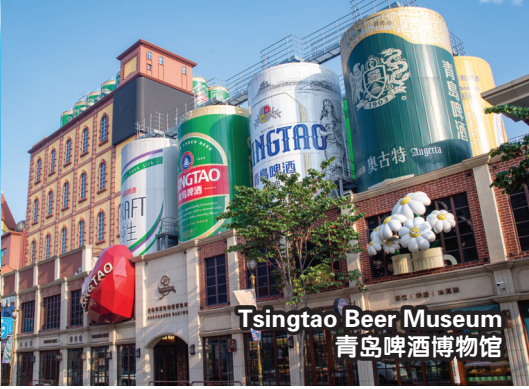
Tsingtao Beer Museum 青岛啤酒博物馆