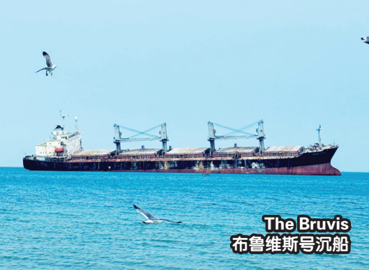
The Bruvis 布鲁维斯号沉船