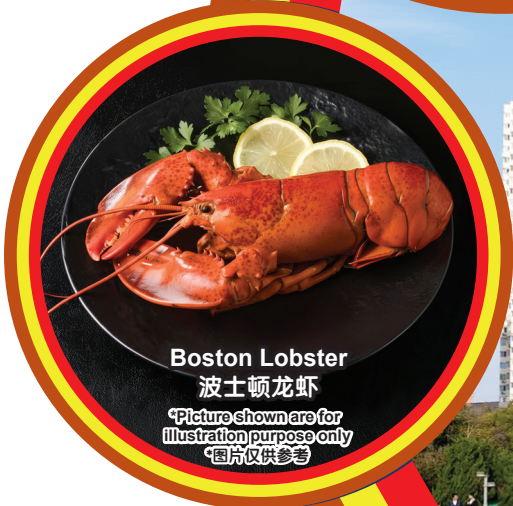
Boston Lobster 波士顿龙虾

Picture shown are for illustration purpose only *图片仅供参考*