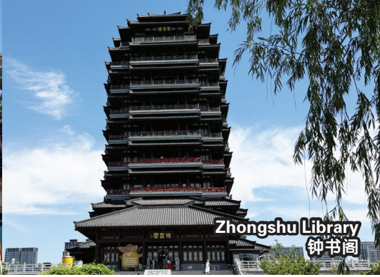
Zhongshu Library 钟书阁