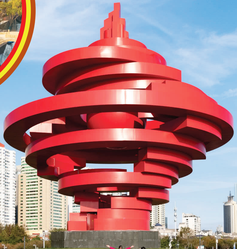
May Fourth Square 五四广场

Picture shown are for illustration purpose only *图片仅供参考*