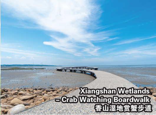
Xiangshan Wetlands - Crab Watching Boardwalk 香山湿地赏蟹步道