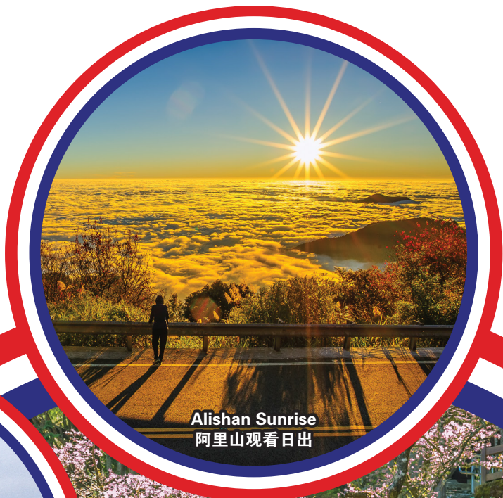
Alishan Sunrise 阿里山观看日出