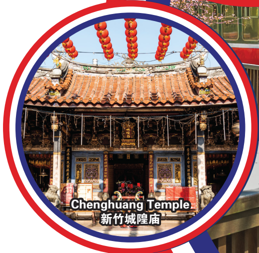
Chenghuang Temple 新竹城隍庙