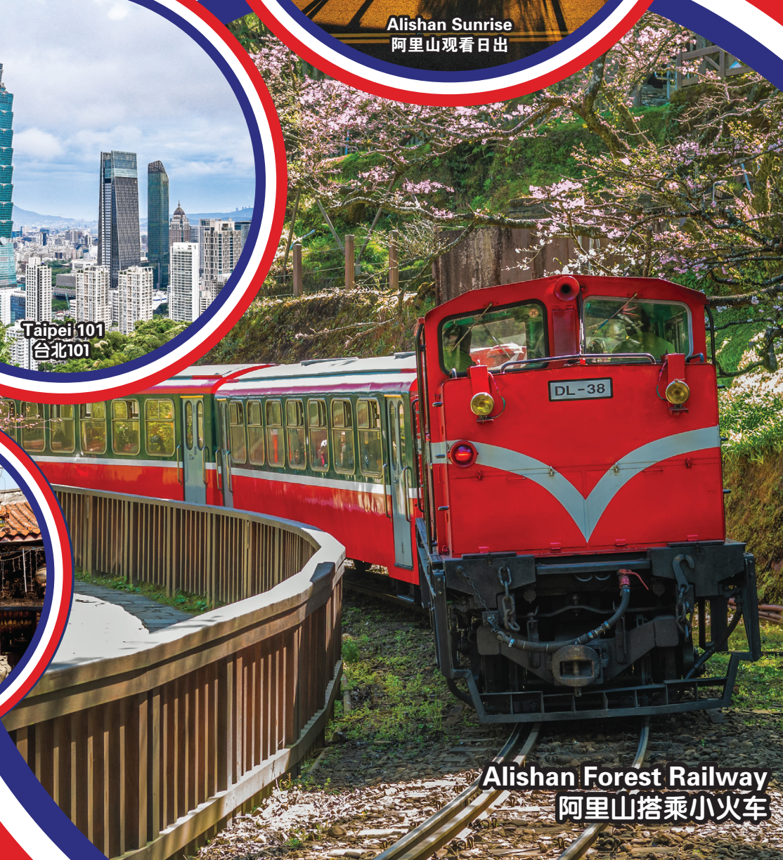
Alishan Forest Railway 阿里山搭乘小火车

行程次序，以当地旅社安排为准。 Sequences of Itinerary are subject to local arrangement.