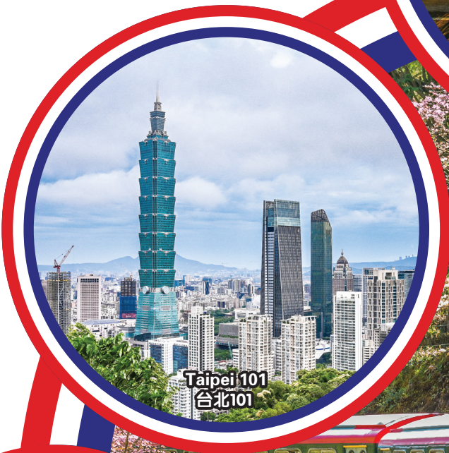
Taipei 101 台北101