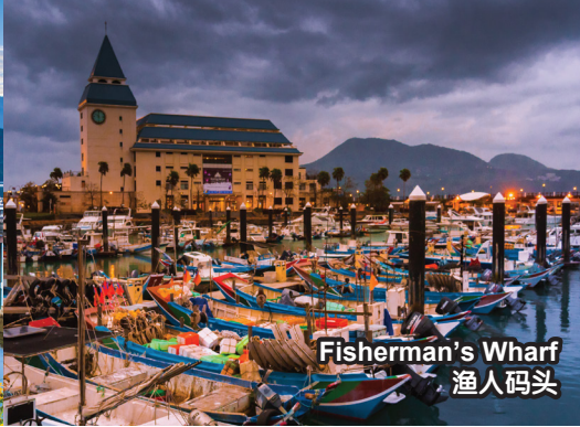
Fisherman's Wharf 渔人码头