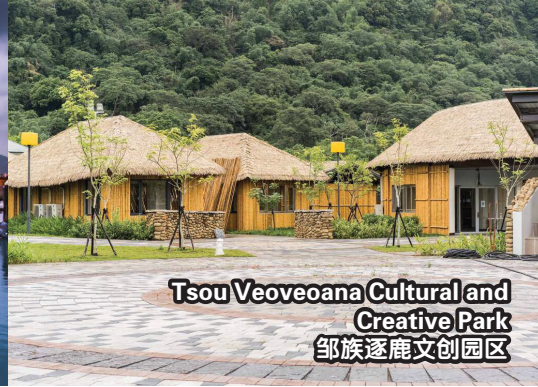
Tsou Veoveoana Cultural and Creative Park 邹族逐鹿文创园区