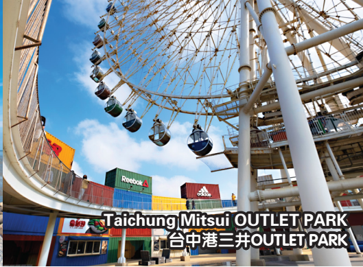
Taichung Mitsui OUTLET PARK 台中港三井OUTLET PARK