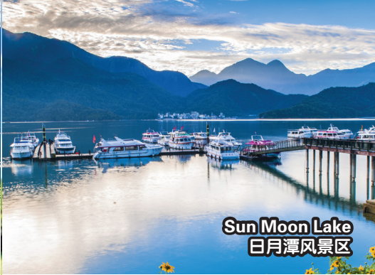
Sun Moon Lake 日月潭风景区