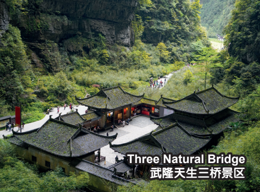
Three Natural Bridge 武隆天生三桥景区