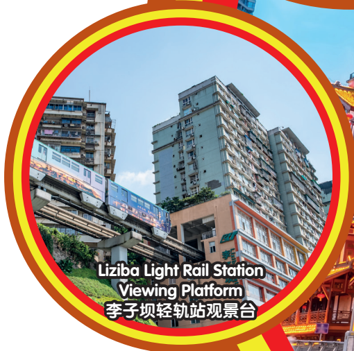
Liziba Light Rail Station Viewing Platform 李子坝轻轨站观景台