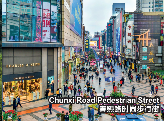
Chunxi Road Pedestrian Street 春熙路时尚步行街