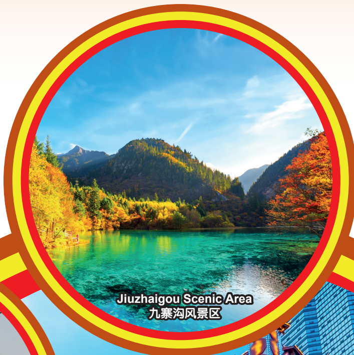
Jiuzhaigou Scenic Area 九寨沟风景区