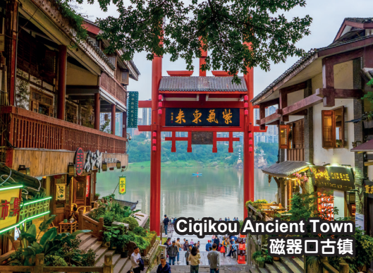
Ciqikou Ancient Town 磁器口古镇