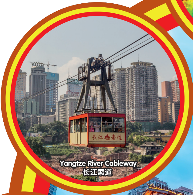
Yangtze River Cableway 长江索道