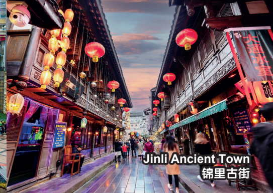
Jinli Ancient Town 锦里古街