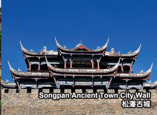
Songpan Ancient Town City Wall 松潘古城