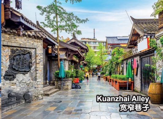
Kuanzhai Alley 宽窄巷子