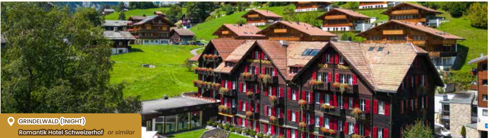
📍 GRINDELWALD (1NIGHT) Romantik Hotel Schweizerhof or similar

*Triple Room Sharing Will Be Base on Extra Roll in Bed Basis. / *任何三人房或加床统一采用折叠式或床垫为标准。