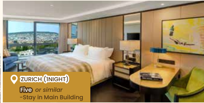
📍 ZURICH (1NIGHT) Five or similar -Stay in Main Building