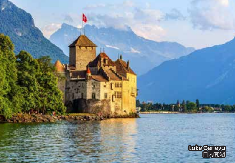
Lake Geneva 日内瓦湖