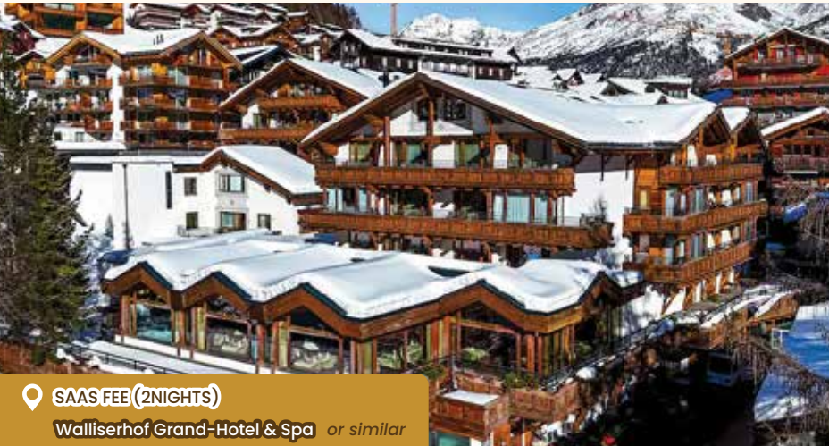
📍 SAAS FEE (2NIGHTS) Walliserhof Grand-Hotel & Spa or similar