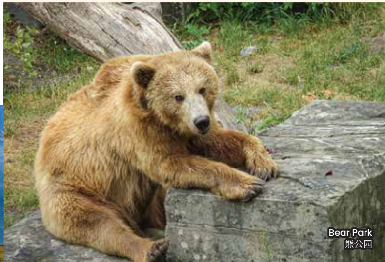
Bear Park 熊公园

Sequences of itinerary are subject to local arrangement. Itineraries, meals, hotels and transportation are subject to change without prior notice.