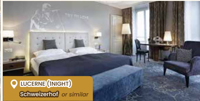
📍 LUCERNE (1NIGHT) Schweizerhof or similar