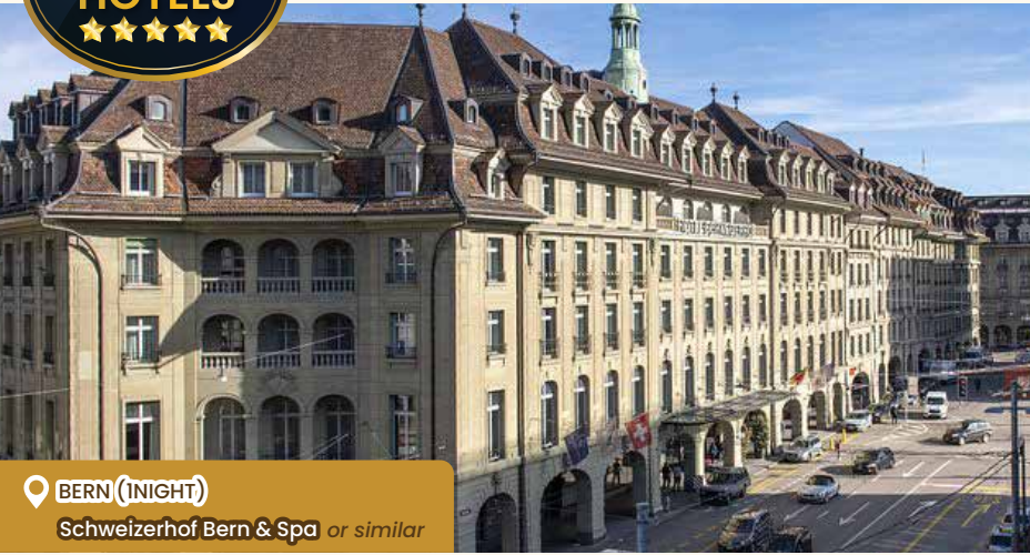
📍 BERN (1NIGHT) Schweizerhof Bern & Spa or similar

Embark on a complete journey at 5 star hotel, offering a quality & comfortable stay. 全程安排五星级酒店，让您在整个旅程中享受到有质量且舒适的住宿环境。