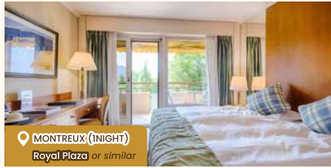
📍 MONTREUX (1NIGHT) Royal Plaza or similar