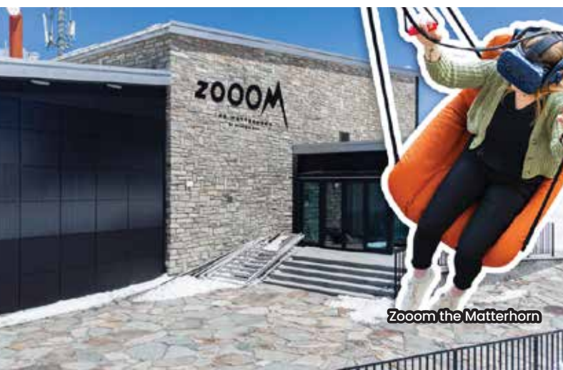
Zoom the Matterhorn

行程次序以当地旅行社安排为准。行程，膳食，住宿，交通等可能会因不可抗力因素而更动，恕不另行通知。