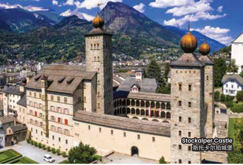
Stockalper Castle 斯托卡尔珀城堡