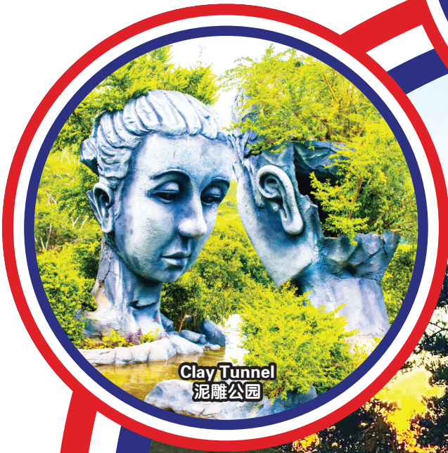
Clay Tunnel 泥雕公园