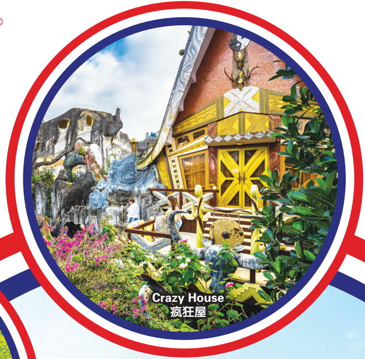
Crazy House 疯狂屋