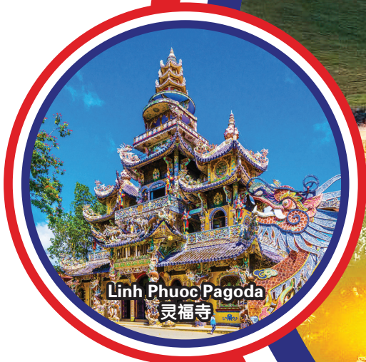
Linh Phuoc Pagoda 灵福寺