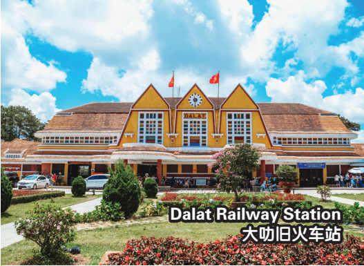
Dalat Railway Station 大叻旧火车站