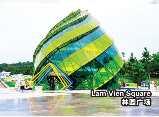
Lam Vien Square 林园广场