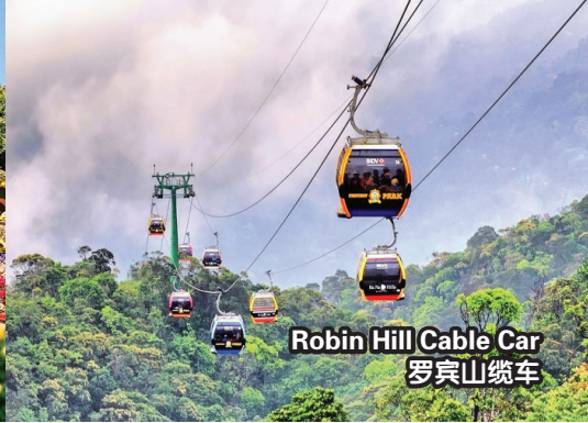
Robin Hill Cable Car 罗宾山缆车