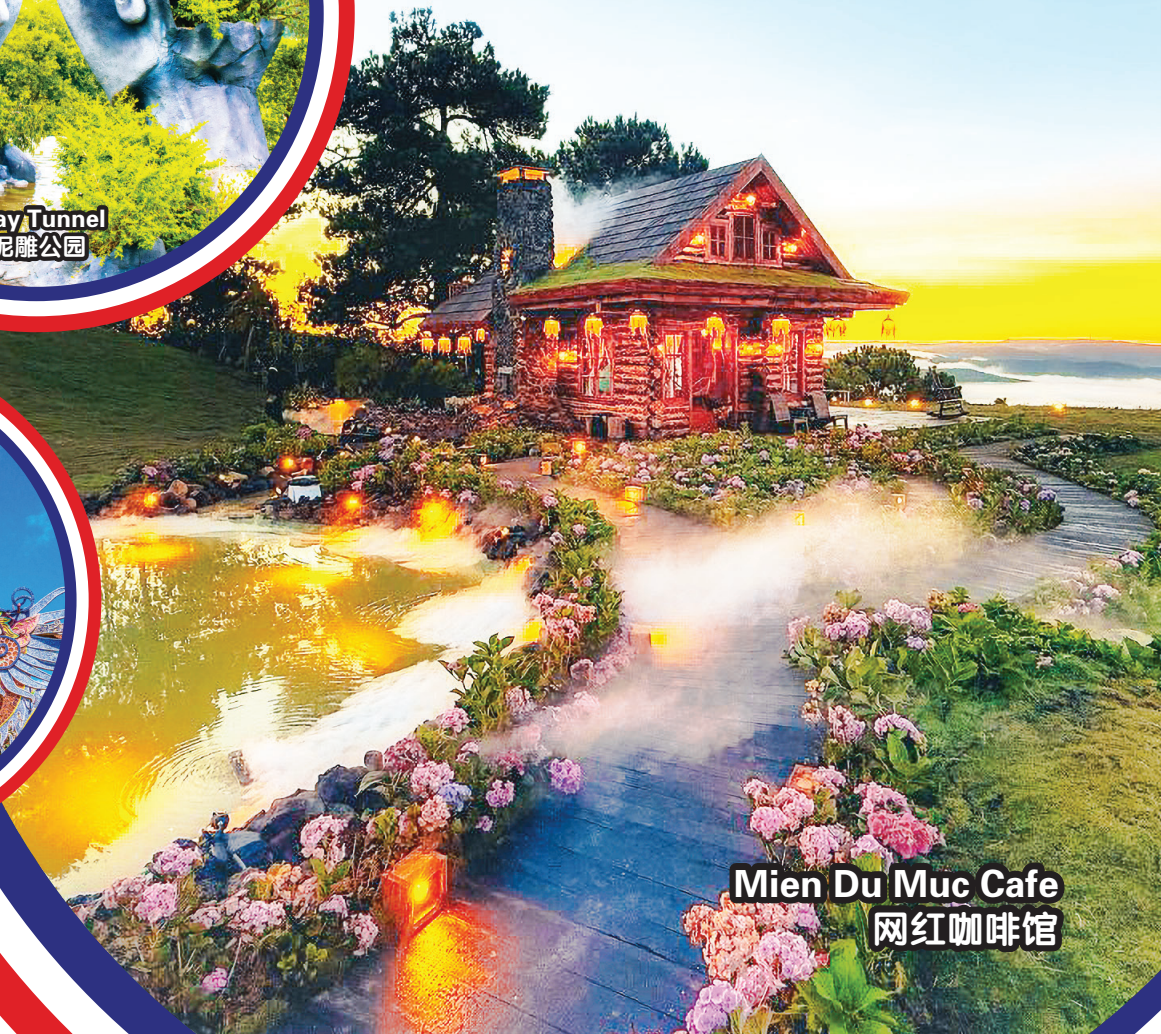
Mien Du Muc Cafe 网红咖啡馆

行程次序，以當地旅社安排為準。 Sequences of Itinerary are subject to local arrangement.