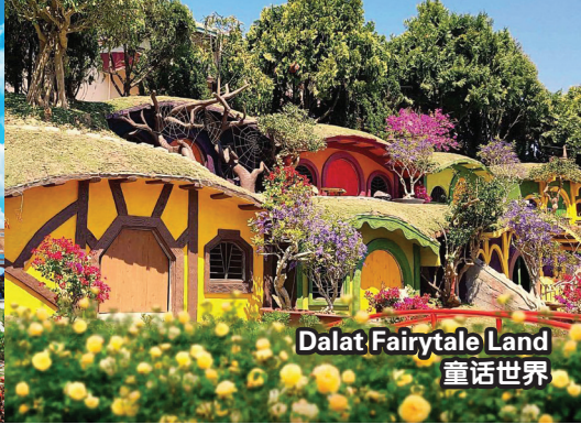
Dalat Fairytale Land 童话世界