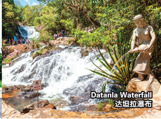
Datanla Waterfall 达坦拉瀑布