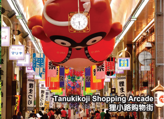
Tanukikoji Shopping Arcade 狸小路购物街