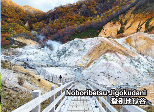
Noboribetsu Jigokudani 登別地獄谷