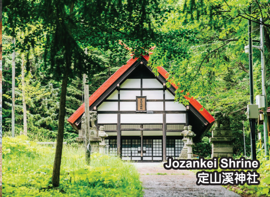
Jozankei Shrine 定山溪神社