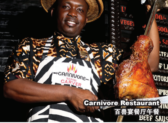
Carnivore Restaurant 百兽宴餐厅午餐 BEEF SAUS