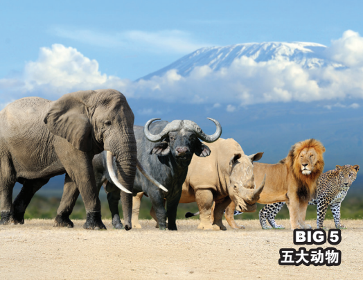
BIG 5 五大动物