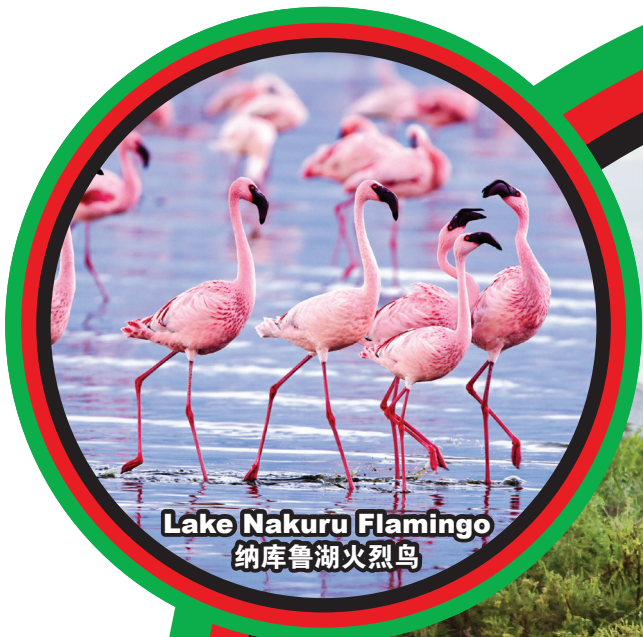
Lake Nakuru Flamingo 纳库鲁湖火烈鸟