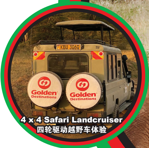
4 x 4 Safari Landcruiser 四轮驱动越野车体验