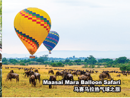
Maasai Mara Balloon Safari 马赛马拉热气球之旅