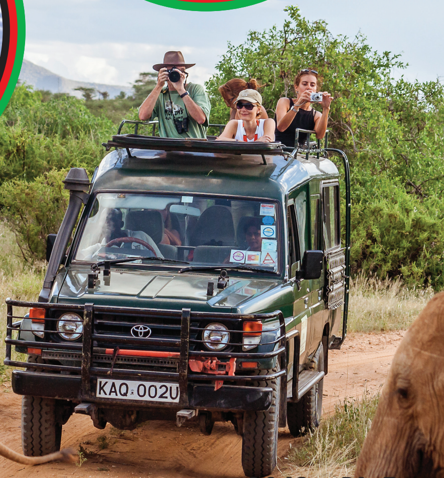
Safari Game Drive Tour 野生动物园游猎之旅