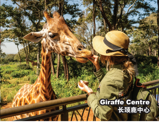
Giraffe Centre 长颈鹿中心