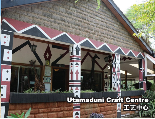
Utamaduni Craft Centre 工艺中心