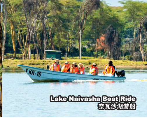
Lake Naivasha Boat Ride 奈瓦沙湖游船