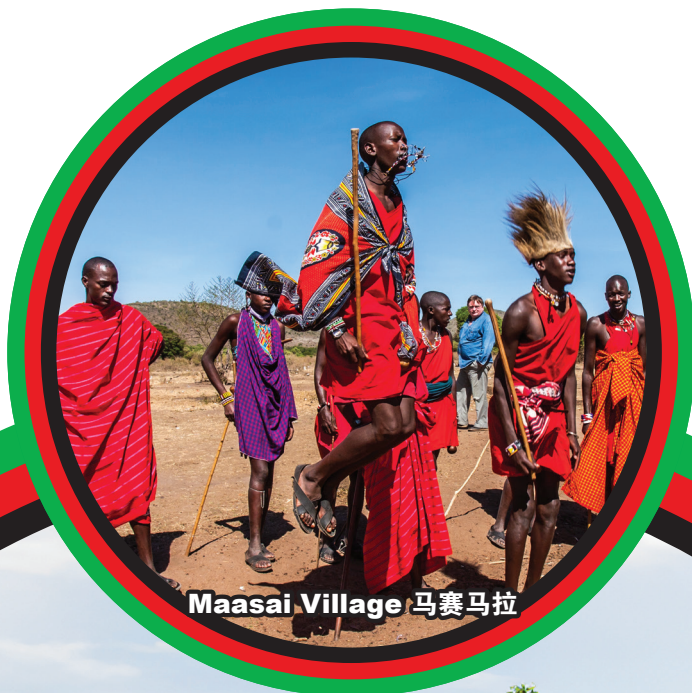
Maasai Village 马赛马拉