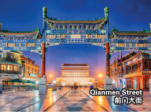
Qianmen Street 前门大街