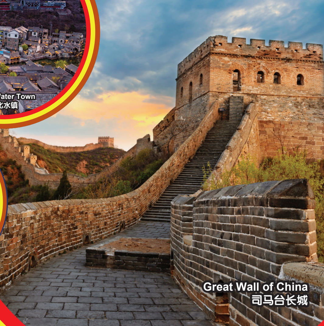
司马台长城 Great Wall of China

行程次序，以当地旅社安排为准。 Sequences of Itinerary are subject to local arrangement.