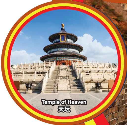
天坛 Temple of Heaven