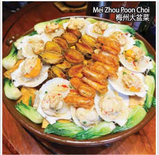
Mei Zhou Poon Choi 梅州大盆菜