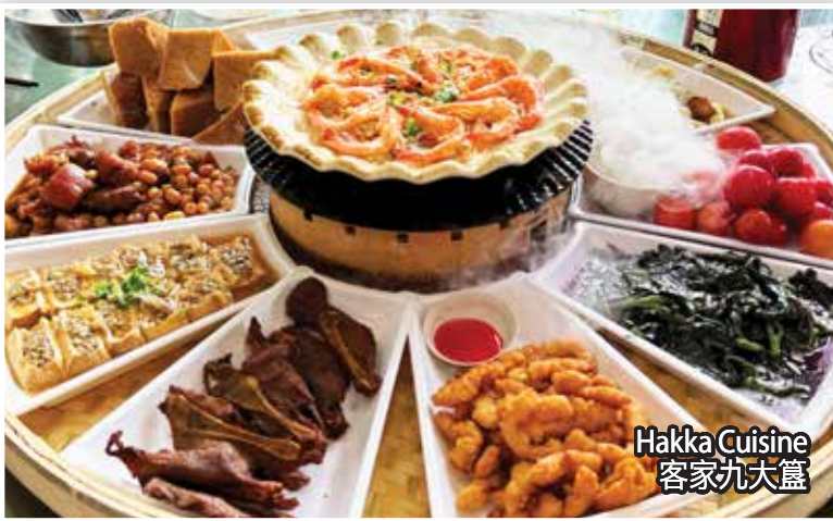
Hakka Cuisine 客家九大簋