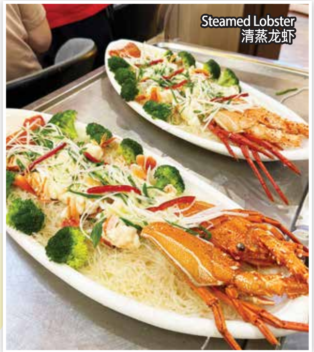
Steamed Lobster 清蒸龙虾