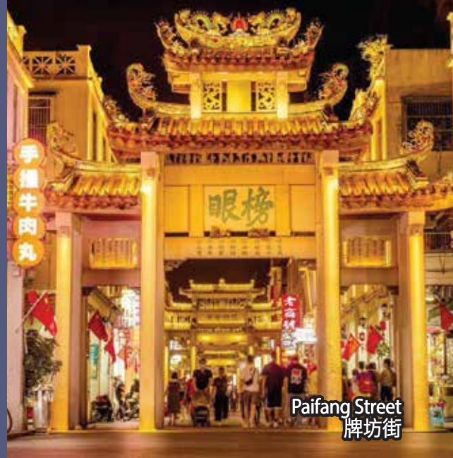
Paifang Street 牌坊街