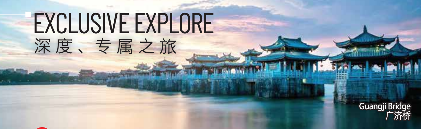
Guangji Bridge 广济桥