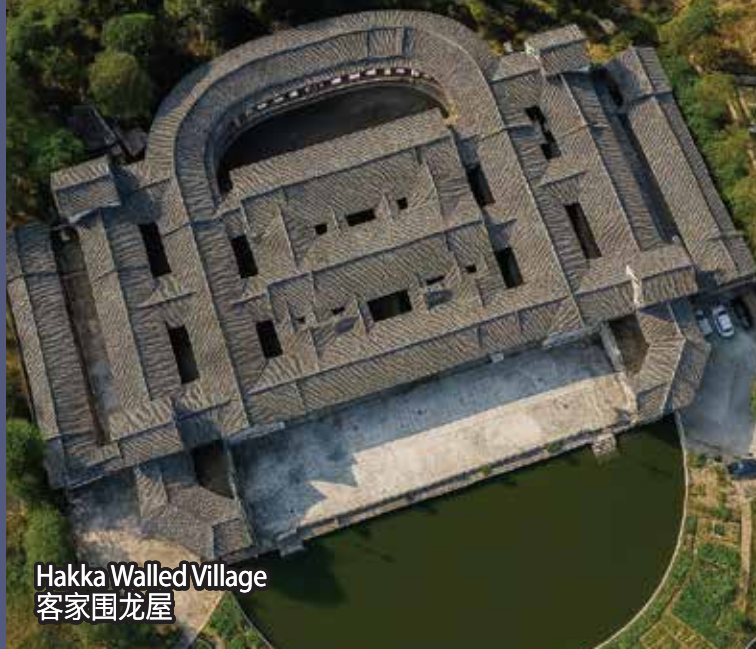
Hakka Walled Village 客家围龙屋