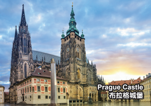
Prague Castle 布拉格城堡