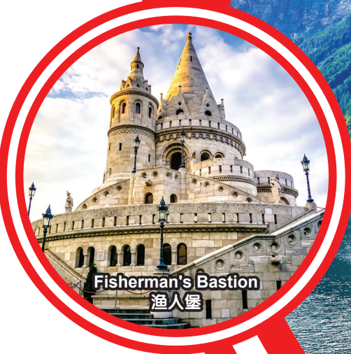
Fisherman's Bastion 渔人堡