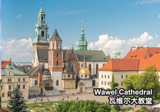
Wawel Cathedral 瓦维尔大教堂