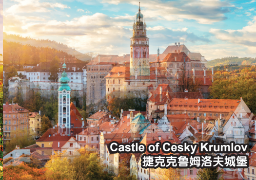
Castle of Cesky Krumlov 捷克克鲁姆洛夫城堡