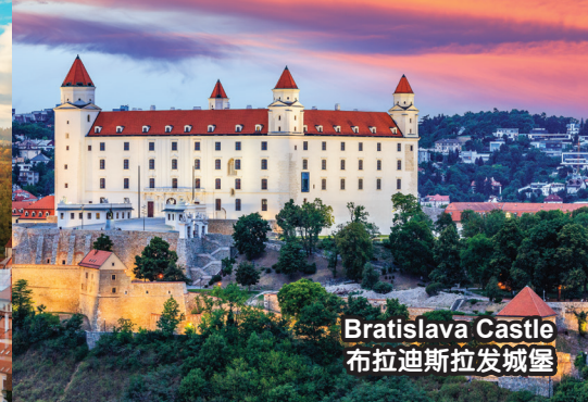
Bratislava Castle 布拉迪斯拉发城堡