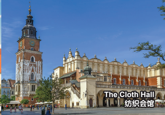
The Cloth Hall 纺织会馆