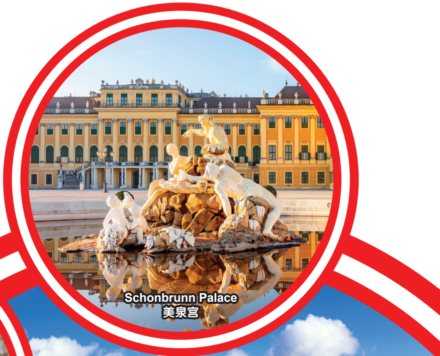
Schonbrunn Palace 美泉宫