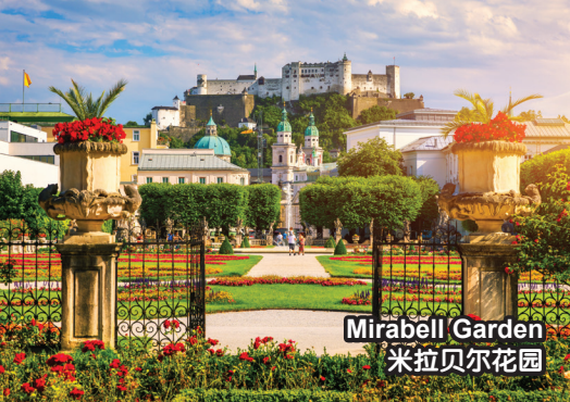
Mirabell Garden 米拉贝尔花园