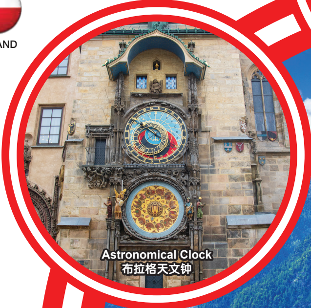
Astronomical Clock 布拉格天文钟