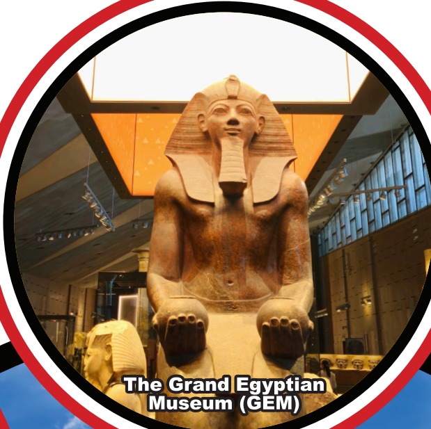
The Grand Egyptian Museum (GEM)