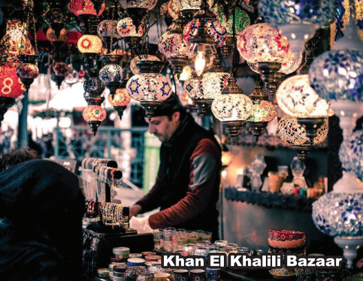
Khan El Khalili Bazaar