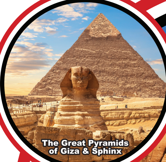
The Great Pyramids of Giza & Sphinx