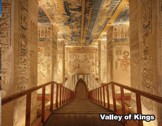
Valley of Kings