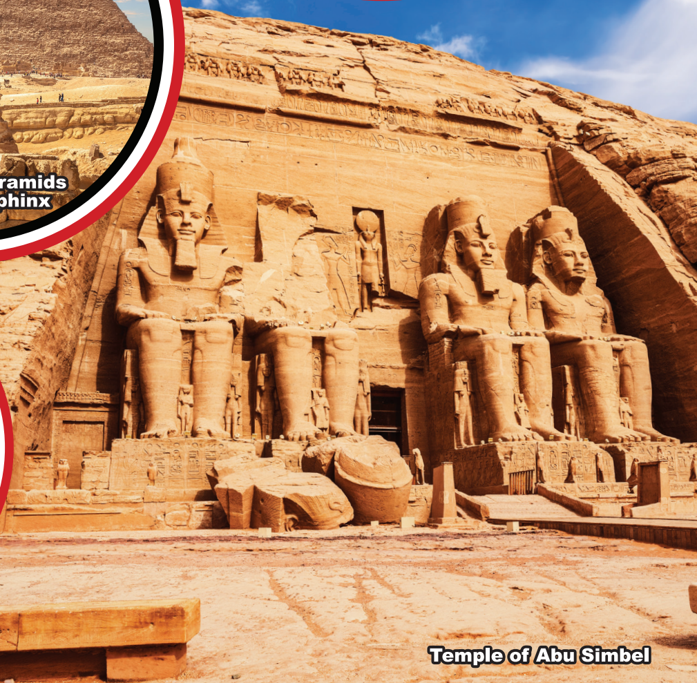
Temple of Abu Simbel