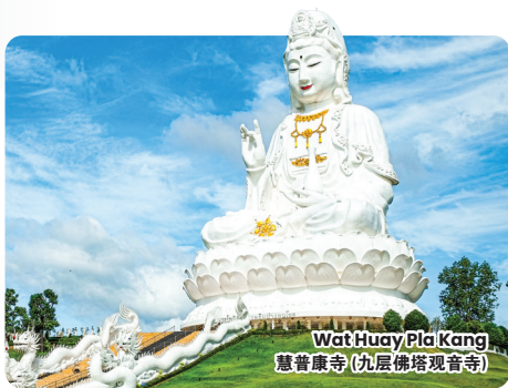
Wat Huay Pla Kang 慧普康寺 (九层佛塔观音寺)