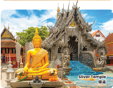
Silver Temple 银庙