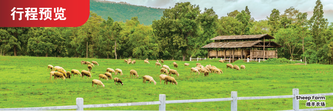
Sheep Farm 绵羊农场