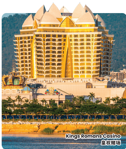
Kings Romans Casino 皇极赌场