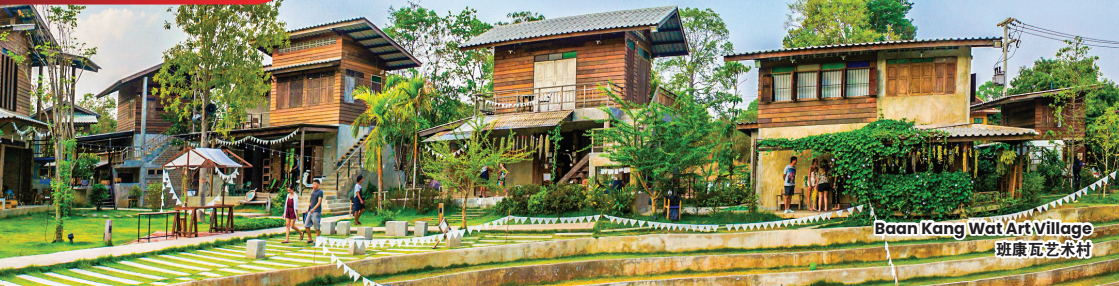
Baan Kang Wat Art Village 班康瓦艺术村