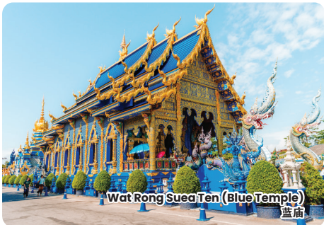
Wat Rong Suea Ten (Blue Temple) 蓝庙

免责声明: 由于新冠肺炎疫情旅行限制当地/宗教节日、公众假期、天气状况、交通等情况, 自然灾害, 必要时黄金旅程保留对行程进行适当调整 (调整景点游览顺序) 以确保行程顺利进行, 会或否事先通知。