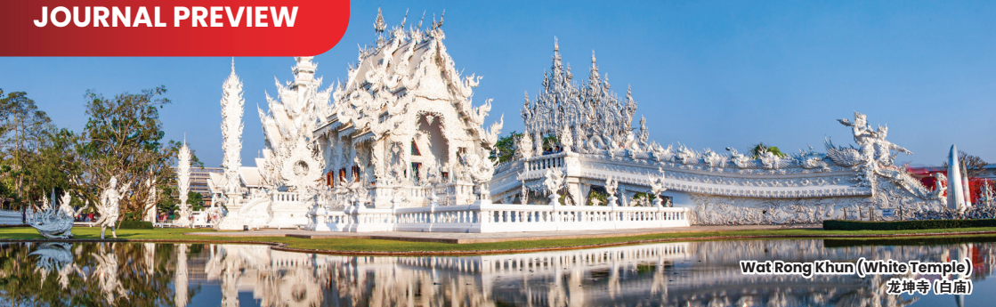
Wat Rong Khun (White Temple) 龙坤寺 (白庙)