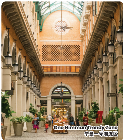
One Nimman Trendy Zone 宁曼一号潮流区