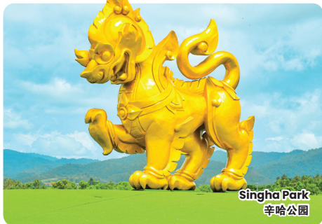
Singha Park 辛哈公园

Disclaimer: Due to Covid-19 travel restrictions, local / religious festivals, public holidays, weather condition, transport technical issue, acts of nature, Golden Destinations reserved the right to alter the sequence or change, amend or alter the itinerary if necessary, with or without prior notice.