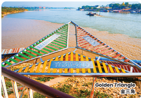
Golden Triangle 金三角