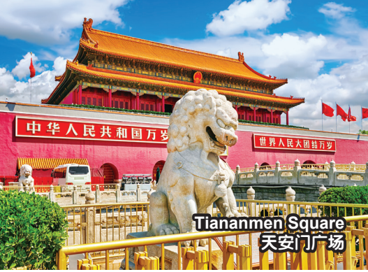
Tiananmen Square 天安门广场