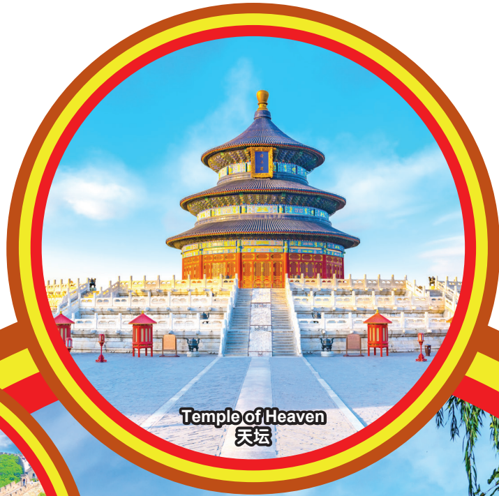
Temple of Heaven 天坛