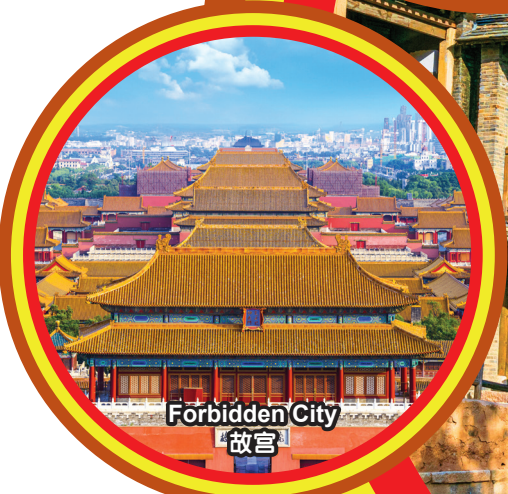
Forbidden City 故宫