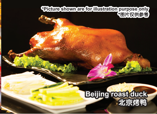
Beijing roast duck 北京烤鸭

*Picture shown are for illustration purpose only *图片仅供参考