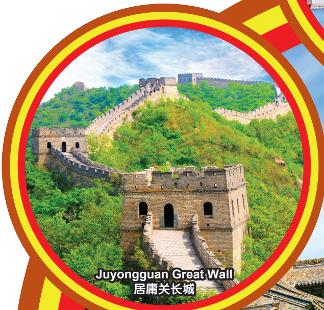
Juyongguan Great Wall 居庸关长城