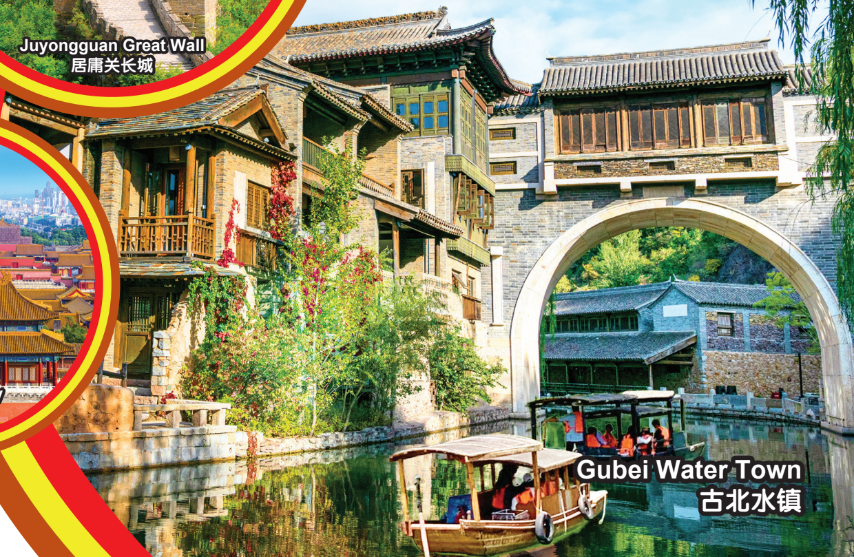
Gubei Water Town 古北水镇

行程次序·以当地旅社安排为准。 Sequences of Itinerary are subject to local arrangement.