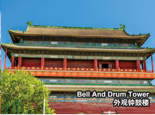
Bell And Drum Tower 外观钟鼓楼