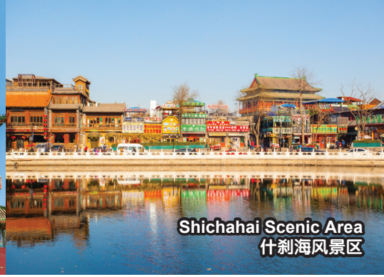
Shichahai Scenic Area 什刹海风景区