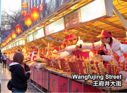
Wangfujing Street 王府井大街