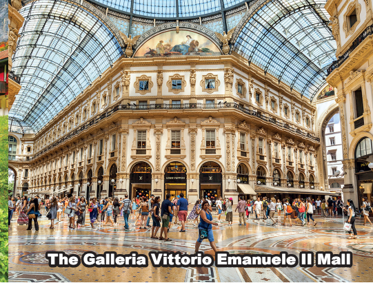
The Galleria Vittorio Emanuele II Mall