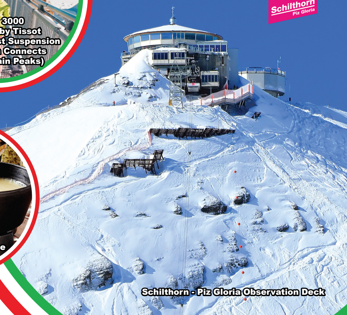
Schilthorn - Piz Gloria Observation Deck