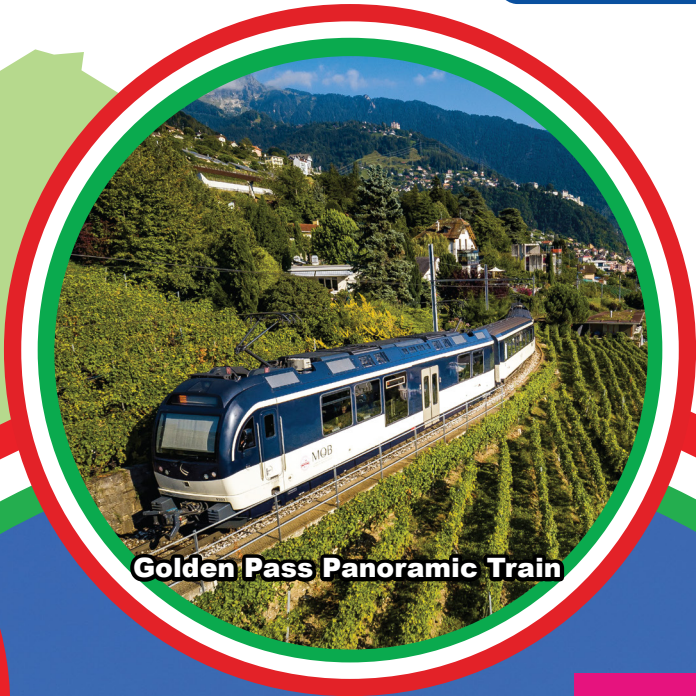
Golden Pass Panoramic Train