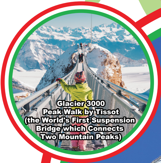
Glacier 3000 Peak Walk by Tissot (the World's First Suspension Bridge which Connects Two Mountain Peaks)