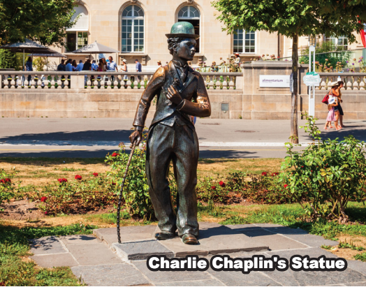
Charlie Chaplin's Statue