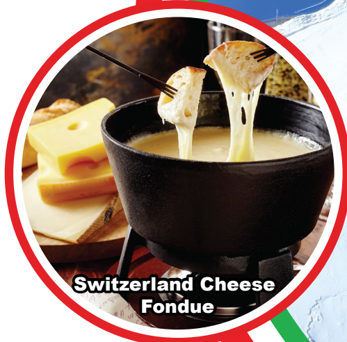
Switzerland Cheese Fondue