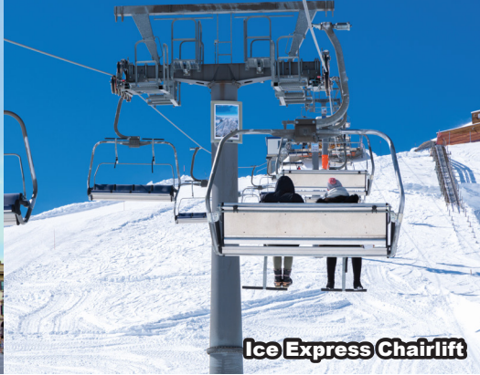
Ice Express Chairlift