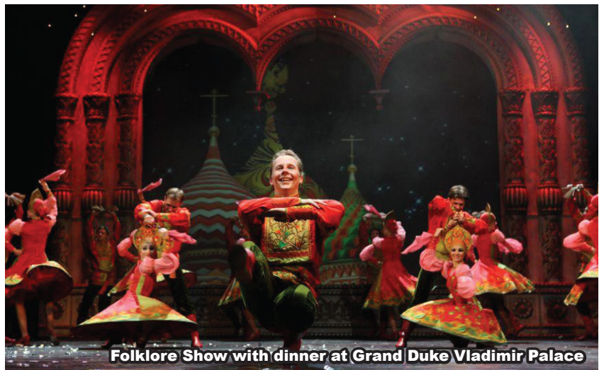
Folklore Show with dinner at Grand Duke Vladimir Palace