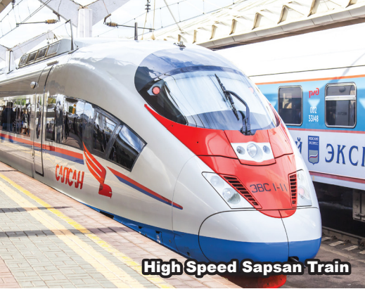
High Speed Sapsan Train