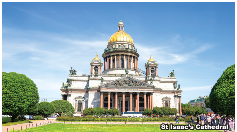
St Isaac's Cathedral