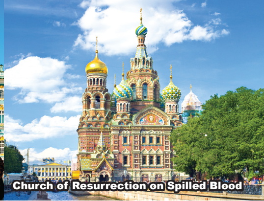
Church of Resurrection on Spilled Blood