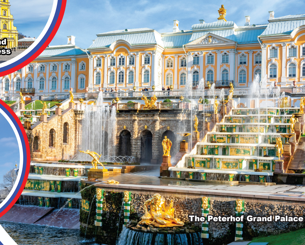
The Peterhof Grand Palace