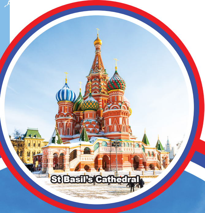
St Basil's Cathedral