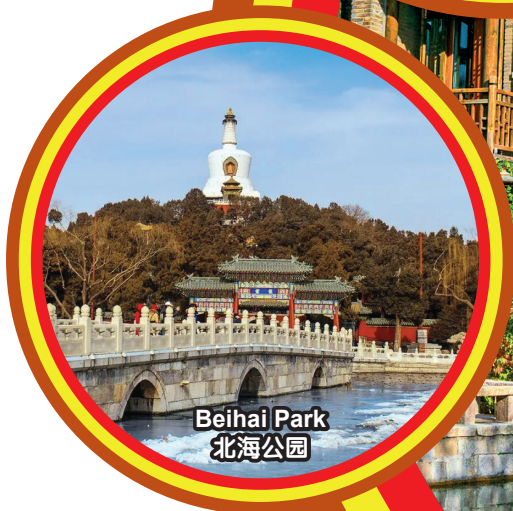
Beihai Park 北海公园

行程次序，以当地旅社安排为准。 Sequences of Itinerary are subject to local arrangement.