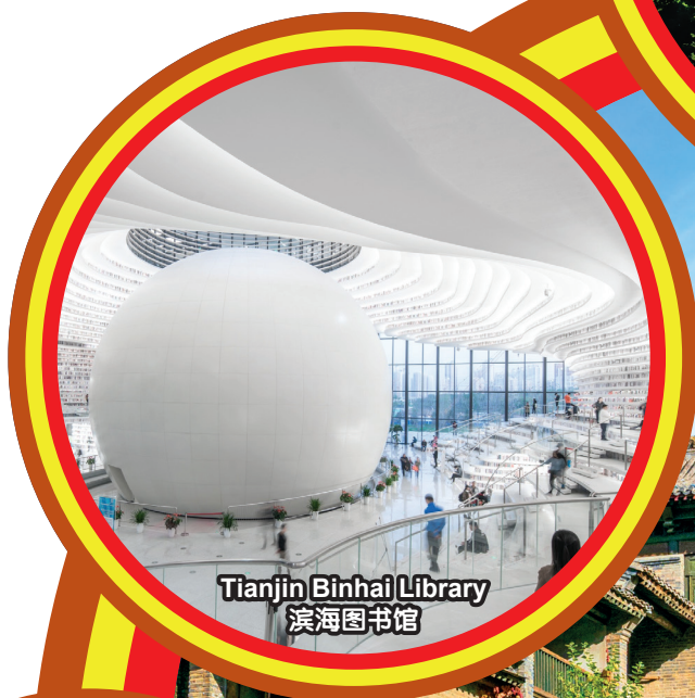
Tianjin Binhai Library 滨海图书馆