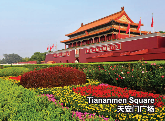
Tiananmen Square 天安门广场