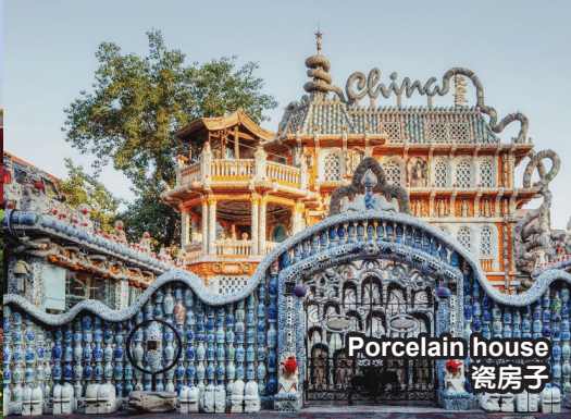
Porcelain house 瓷房子