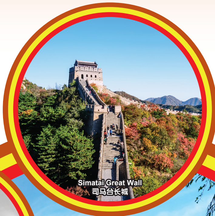
Simatai Great Wall 司马台长城