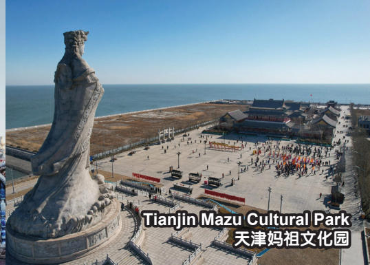
Tianjin Mazu Cultural Park 天津妈祖文化园