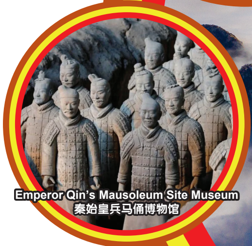
Emperor Qin's Mausoleum Site Museum 秦始皇兵马俑博物馆