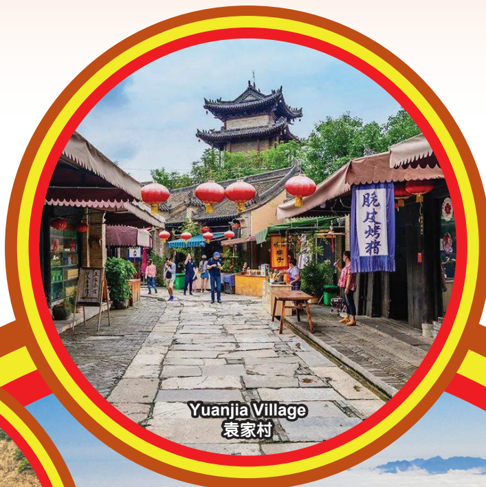
Yuanjia Village 袁家村