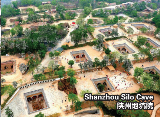
Shanzhou Silo Cave 陕州地坑院