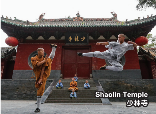
Shaolin Temple 少林寺