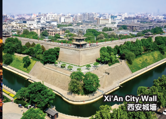
Xi'an City Wall 西安城墙