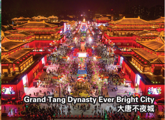
Grand Tang Dynasty Ever Bright City 大唐不夜城