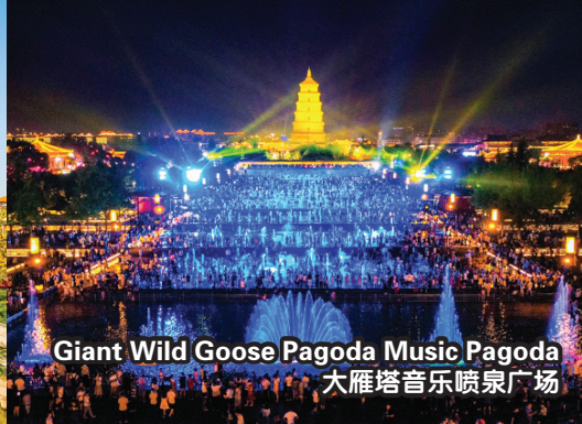
Giant Wild Goose Pagoda Music Fountain 大雁塔音乐喷泉广场