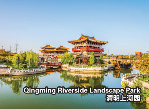
Qingming Riverside Landscape Park 清明上河园