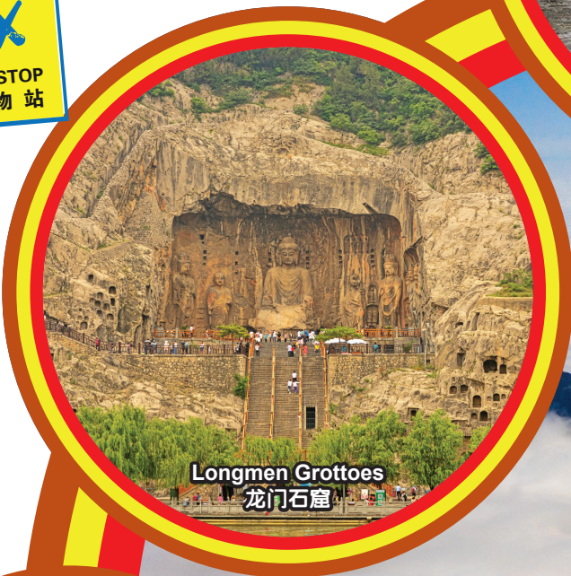
Longmen Grottoes 龙门石窟