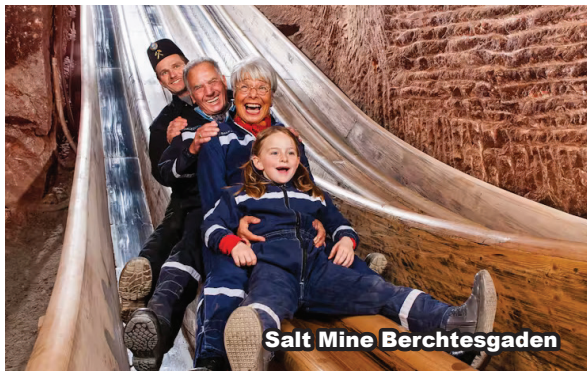
Salt Mine Berchtesgaden