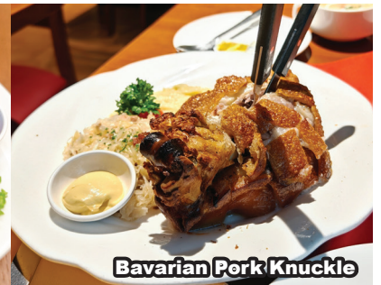
Bavarian Pork Knuckle