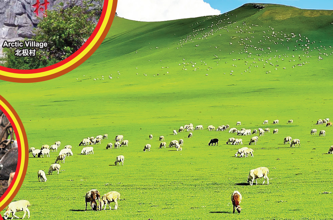
Hulunbuir Grassland 呼伦贝尔大草原

行程次序，以当地旅社安排为准。 Sequences of Itinerary are subject to local arrangement.