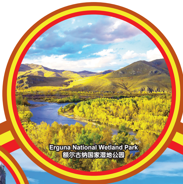
Erguna National Wetland Park 额尔古纳国家湿地公园