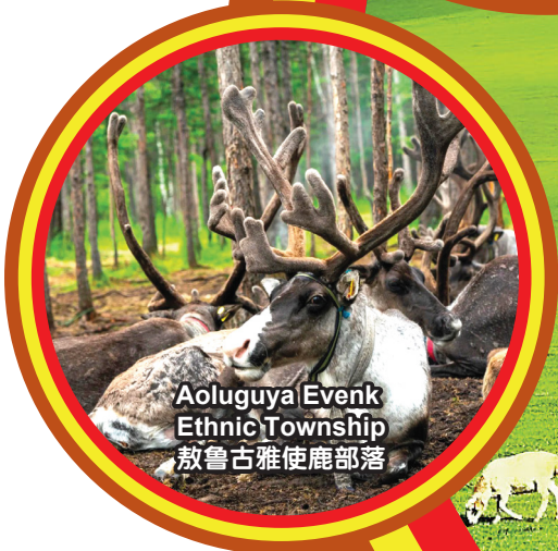
Aoluguya Evenk Ethnic Township 敖鲁古雅使鹿部落