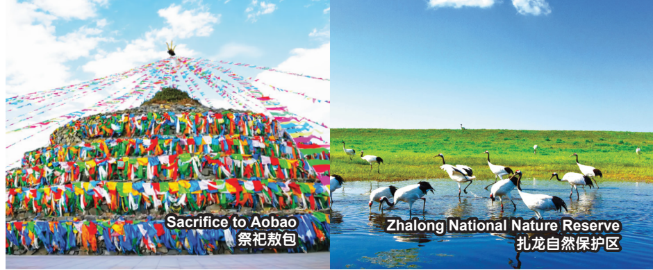
Sacrifice to Aobao 祭祀敖包