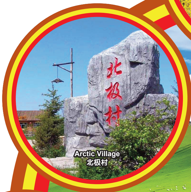
Arctic Village 北极村